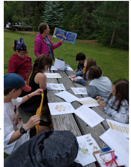
Left: counselors and 4-H staff

“Not all classrooms have four walls” was a good description of the nature classes including bees and pollinators, Leave No Trace When in the Outdoors, stream health, hiking to look at flora/fauna /insects, and archery. This natural resource based camp was funded in part by the Sherman County 4-H Assn, the Sherman County Soil & Water Conservation District, Sherman County Prevention, private donations and camper fees.