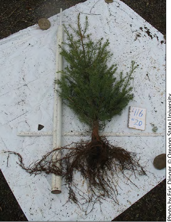
Figure 7b. Seedling was dug up after growing for two seasons with less than 20 percent weed cover. Note the increased diameter growth, more developed root system, and fuller crown.