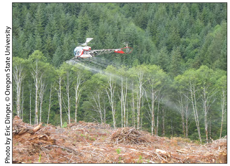
Figure 4. Helicopters allow for precision application of herbicide over rough terrain.