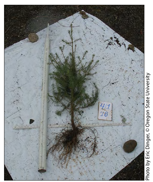
Figure 7a. Seedling was dug up after growing for two seasons with no vegetation control.

Getting seedlings to free-to-grow status at the earliest possible age can shorten the time needed for forest stands to reach harvestable size (rotation). Shorter rotation reduces the number of years you must pay interest on financing to cover initial expenses such as reforestation and conifer release; therefore, you'll realize investment returns sooner.