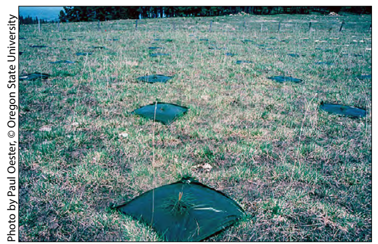
Figure 6. Mulch mats and other forms of mulch can be effective for grass and herbaceous weed control but tend to be expensive.