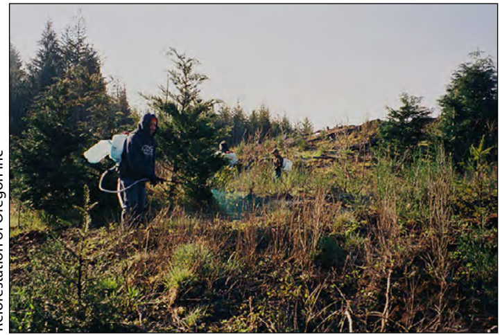
Figure 5. Backpack sprayers can be used for broadcast or targeted spraying of competing vegetation.

For proper application method and chemical selection, see the current edition of the Pacific Northwest Weed Management Handbook . Always read and follow label directions.