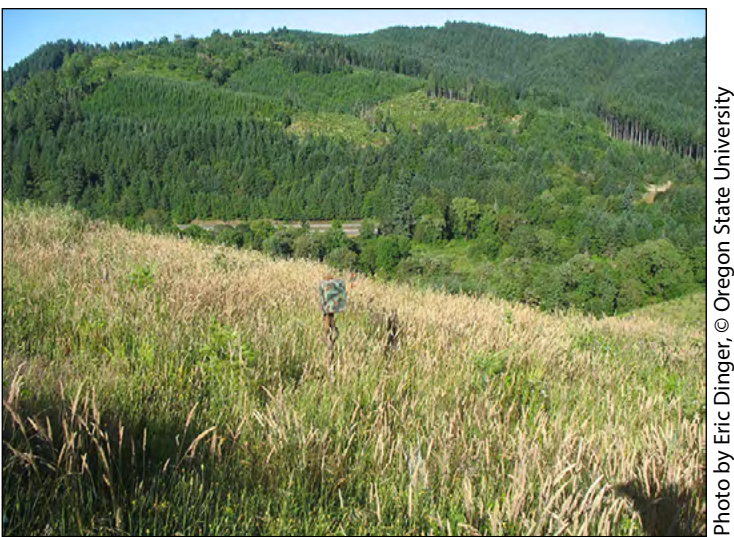
Figure 1. Grasses compete aggressively with planted conifers for moisture.

During the summer, competition for nutrients and moisture can become critical for newly established conifers. Moisture competition from grasses and forbs can affect growth and, ultimately, survival.