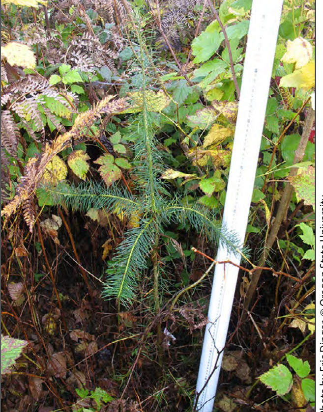
Figure 2. Three-year-old seedling stunted by overtopping shrubs.

This is even more important on south-facing slopes, on sites with shallow soils, or when you plant in old fields, where well-established grass competes for moisture.