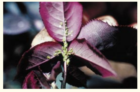
Figure 5.—Colony of aphids on underside of leaf.