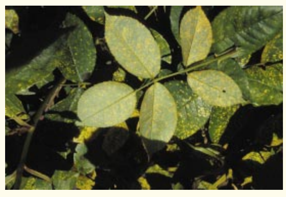
Figure 2.—Rust on both sides of rose leaves.

Spores of the fungus move from plant to plant on air currents. Newly emerging young leaves are the most susceptible to infection by the airborne spores. Within hours of landing on a leaf, spores germinate and grow into leaf tissues through natural openings.