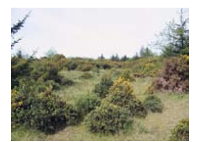
Figure 1.—Gorse infestation.

West Coast of the United States as an ornamental in the late 1800s. Gorse was first found in Oregon in Benton County in 1916. Gorse infestations are concentrated along the Oregon coast, particularly south of Florence (Figure 3, next page). Some infestations exist