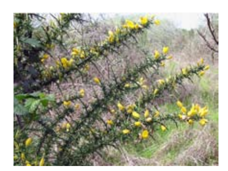
Figure 2.—Gorse flowers and spines.

Gorse easily colonizes newly disturbed sites, poor sites, or sites without vegetation. It often is found along roadsides. On the southwest Oregon coast, gorse has taken over sand dunes, and its dense, impenetrable