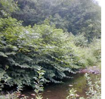
Figures 1a-b.-Giant knotweed thrives in moist, open areas.

habitats but is most prolific and invasive in moist, open areas (Figures 1a-b).