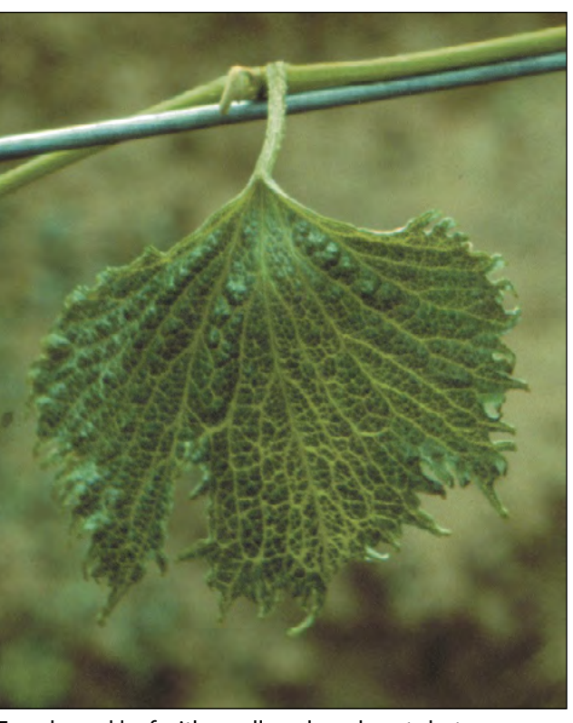
Fan-shaped leaf with small puckered spots between veins and sharp points (enations) at leaf margins, a symptom of 2,4-D drift injury on grape