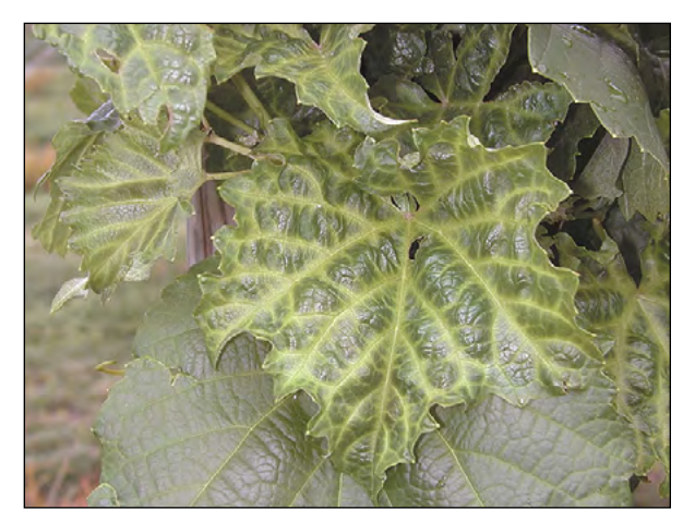
Figure 4. ALS inhibitor injury symptoms from sulfonylurea herbicide spray drift: chlorosis of leaf veins and change in leaf appearance from smooth to crinkled.