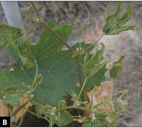
Figure 3. Glyphosate injury symptoms: (A) Distorted leaves. (B) Lateral shoot growth with unusual burst of latent buds on nodes, short internodes, and distorted leaves.