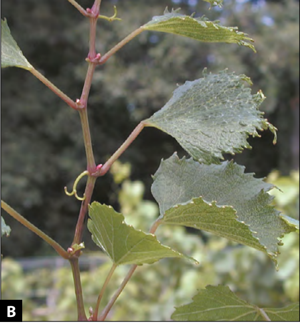
Figure 1. 2,4-D drift injury symptoms: (A) Fan-shaped leaf with small puckered spots between veins and sharp points (enations) at leaf margins. (B) Zigzag shoot growth with shortened internodes.