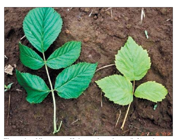
Figure 1.—Nitrogen-sufficient red raspberry (left) and nitrogen-deficient red raspberry (right).

Caneberry plants require chemical elements from air, water, and soil to ensure adequate vegetative growth and fruit production. When levels of these nutrients in the plant are low, growth and yield may be affected. Severely reduced nutrient supply can lead to visible nutrient deficiency symptoms such as leaf discoloration and distortion (Figures 1 and 2). Routine collection and analysis of tissue