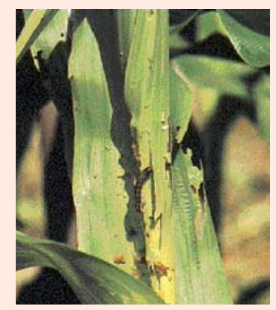
Figure 2. Armyworm damage on corn.