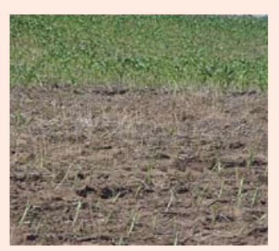
Figure 1. Armyworm damage on grass.

Oregon State Extension UNIVERSITY Service