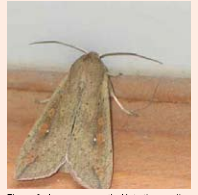
Figure 3. Armyworm moth. Note the small white dot on each forewing.

Amy Peters, Extension livestock faculty, Coos County; and Glenn Fisher, Extension entomologist; both of Oregon State University.