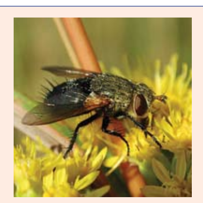
Figure 9. Tachinid fly parasites of armyworm are about the size of houseflies and are active at night.

trials. It seems to be effective only on very small larvae. B. thuringiensis is a soil bacterium cultured commercially and formulated under various trade names for use on crops to control many caterpillar pests. Some formula-