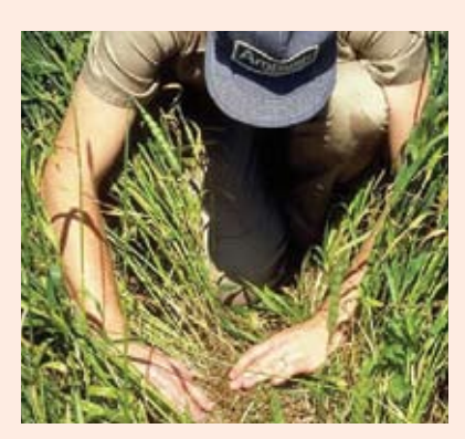
Figure 6. Armyworm larvae remain in the soil or under leaves during the day. Look carefully!

Five to 10 armyworm larvae per square foot in pasture grass probably justifies control. Increasing armyworm numbers and no signs of parasites also indicate a need for applied control.