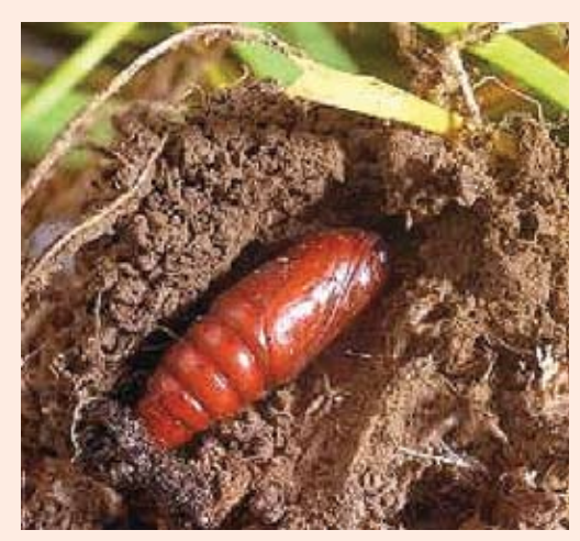
Figure 5. Red, torpedo-shaped pupa of the armyworm.