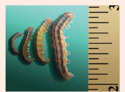
Figure 8. Control is most effective and economical on smaller larvae (1/4 inch).