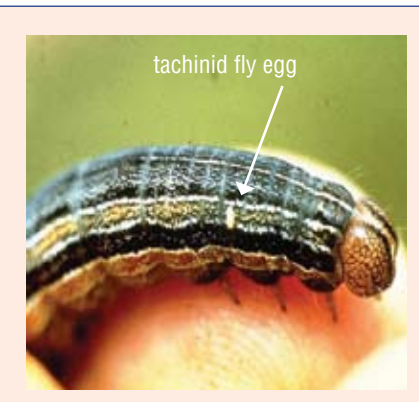
Figure 7. Egg of tachinid fly parasite on armyworm larva.