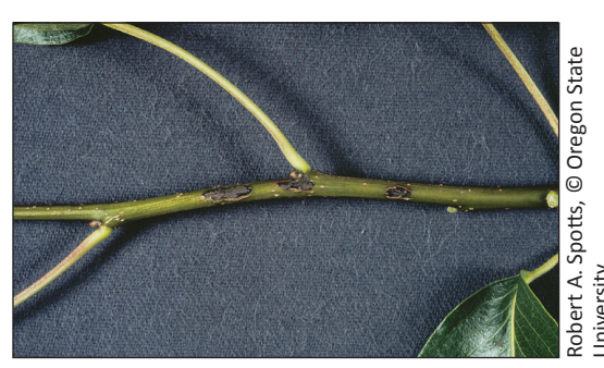
Figure 4. The scab lesions on this twig of Bosc pear have progressed to canker-like areas with corky margins.

conidia need about 2 hours more wetness than ascospores. In areas where overhead irrigation is used, daytime irrigation and night dews may result in infection cycles additional to those resulting from rainy days.