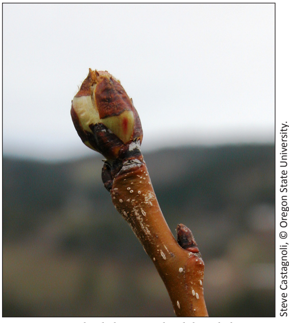
Figure 5. Pear bud showing the delayed-dormant stage of development, with bud scales separated, used to start Part 3 of the model ("End of ascospore season").