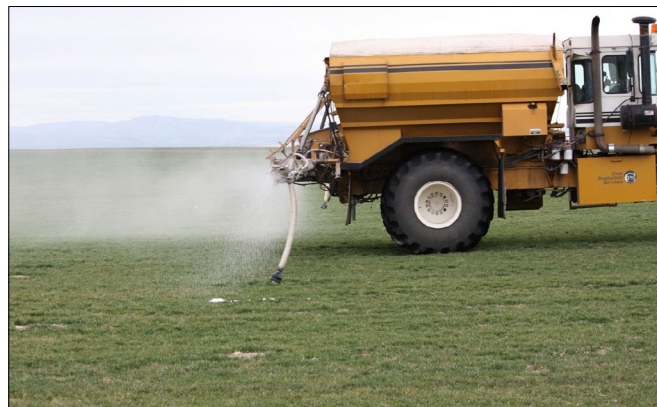
Figure 2. Apply half of the total seasonal N during October or November.

Seed yield reductions can occur if all required N is applied in the spring, so we recommend splitting N applications between fall/spring. Apply one-half or more of the total N for the season during October or November (Figure 2).