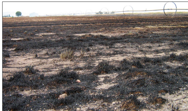
Figure 3.—Burning increases soil pH at the surface, thus increasing the likelihood of N volatilization from fertilizer on the soil surface.

For more information, see Montana State University Extension publication EB 173, Management of Urea Fertilizer to Minimize Volatilization .