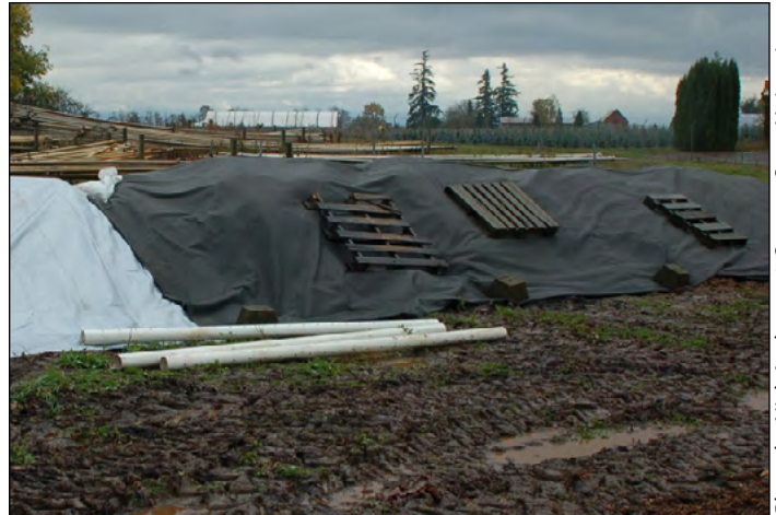
Weighted tarps permit compost piles to shed storm water and reduce leachate generation.