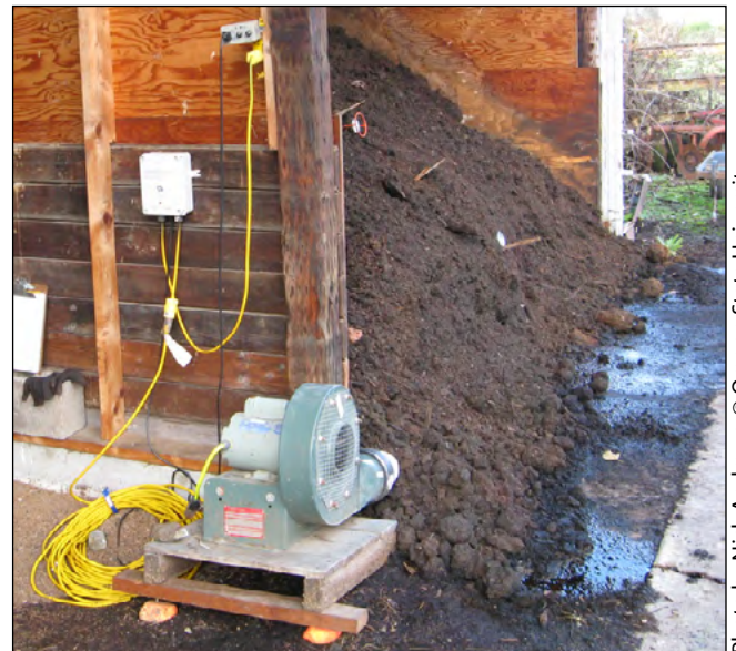
Blowers can be plumbed to push air through the pile, pull air from the pile, or alternate air flow direction.