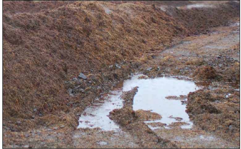
Saturated compost piles generate leachate, a threat to water quality.

The best use of collected leachate is to moisten an actively composting pile early enough in the process to meet PFRP. Alternatively, collected leachate can be applied to cropland requiring water and nutrients. Determine application rates according to the nutrient content of the leachate and the nutrient requirements of the crop.