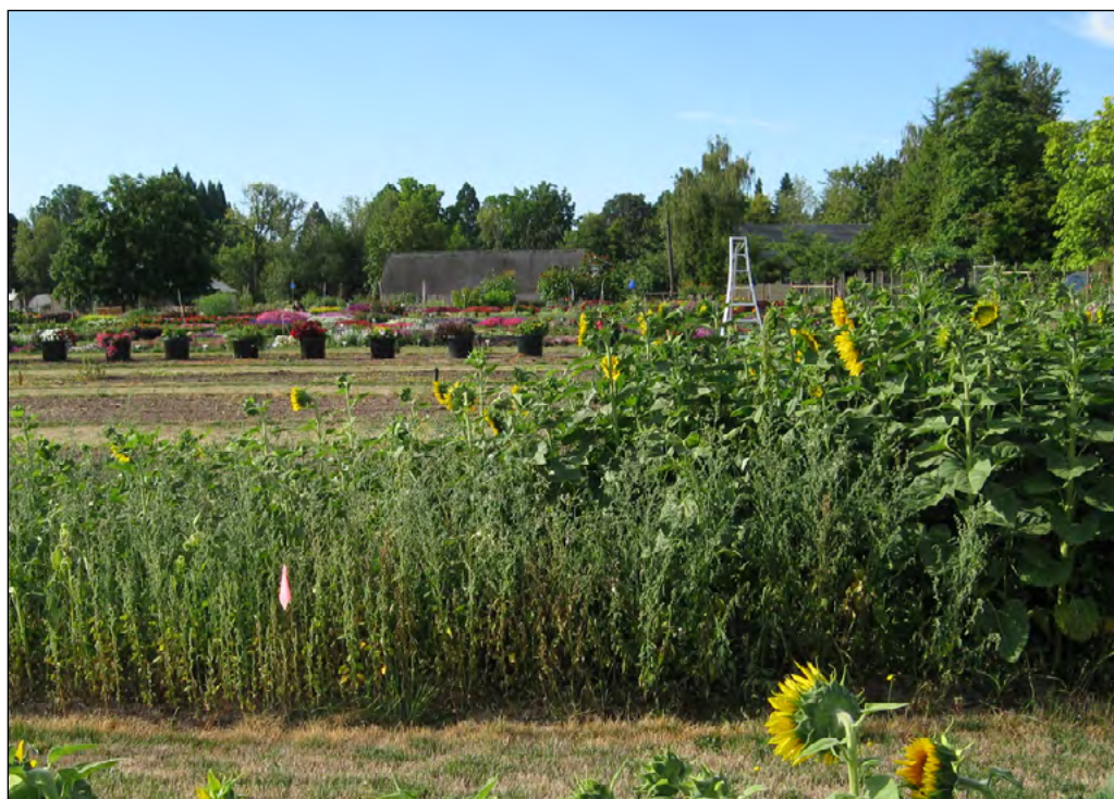
Compost can improve soil quality and plant growth. Sunflowers in compost-amended soil (right) vs. no compost (left).

The Oregon Department of Environmental Quality (DEQ) revised its composting regulations in 2009. This publication is intended to assist farmers who are regulated by DEQ rules to