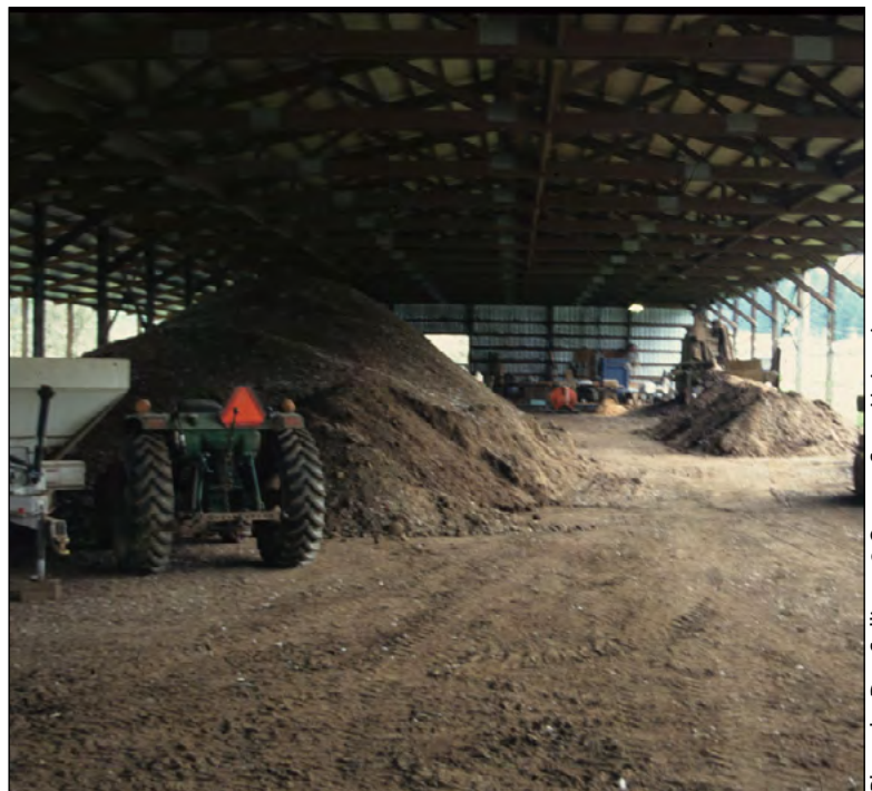
Roofed composting area

When you choose your site, be a good neighbor and reduce the potential for