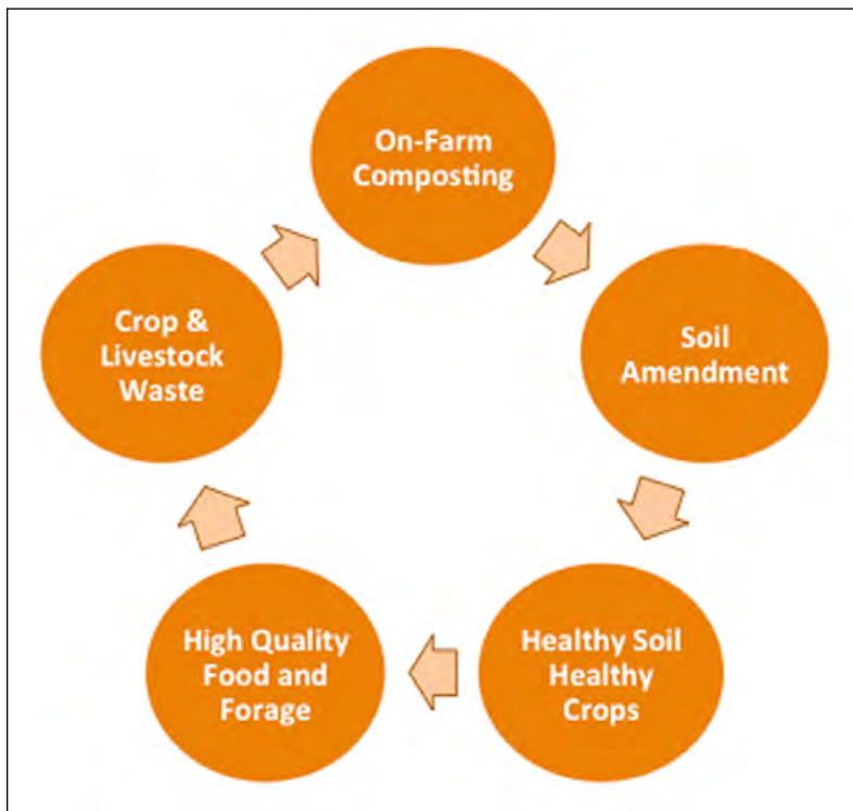
The compost cycle

As you read these chapters, jot down notes and ideas. These can help you develop a site plan and management strategy that will maximize the efficiency of the composting process and minimize threats to water quality.