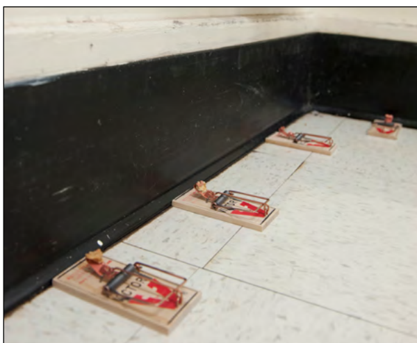
Figure 6. Traps should be baited with a variety of foods. There is no favorite bait for mice.