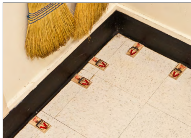
Figure 8. Follow the Set-Remove-Shuffle-Reset sequence to eliminate mice populations quickly. Twelve traps for two or three mice is not too many.