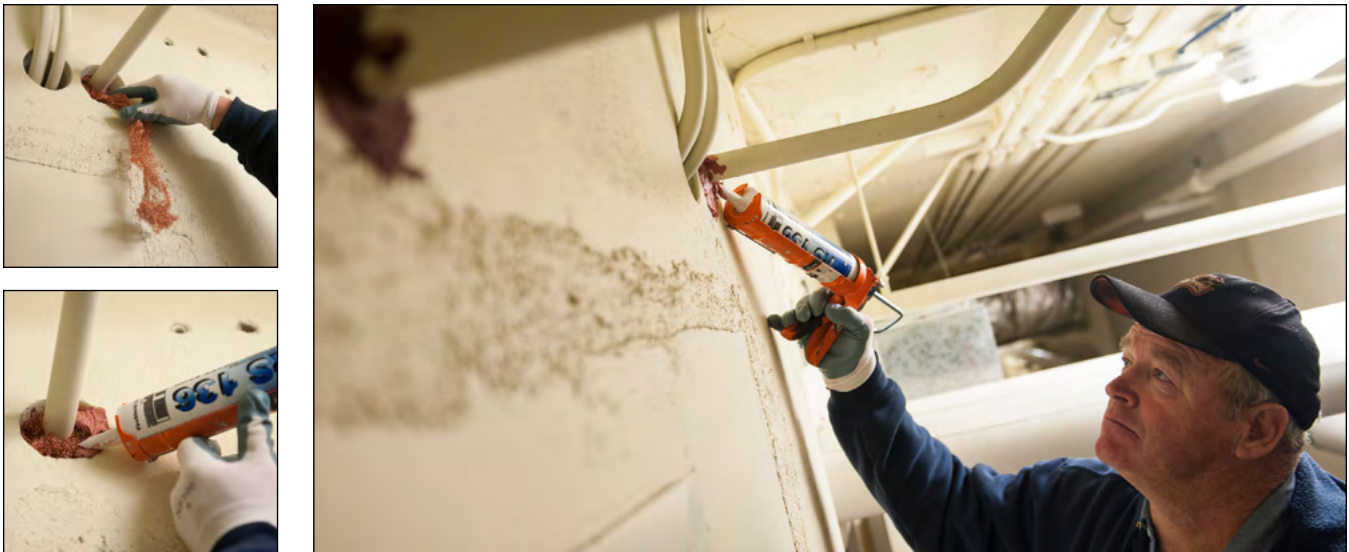
Figure 2. One way house mice find their way into a building is through gaps created for plumbing and wiring. Gaps of ¼ inch or more should be filled with Xcluder cloth then sealed with a siliconized acrylic latex or polyurethane sealant.

they find their way up through the floor along crevices or gaps created by plumbing or other utility lines, following their nose toward food odors or warm or cool air currents. Portable classrooms also contain gaps and openings through broken vent louvers and screens.