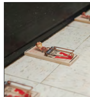
Figure 7. The proper way to position a snap trap against the wall.