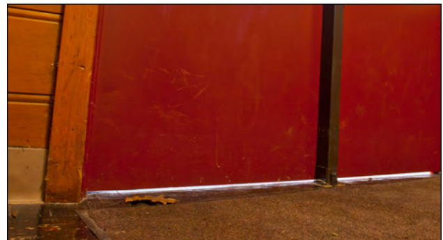
Figure 3. Gaps like these in external doors can be sealed with brush-type door sweeps.