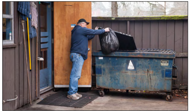
Figure 4. This dumpster is too close to the exterior door.

The mice will also carry in and store relatively large amounts of seeds, nuts, and insect carcasses in floor and wall nooks.