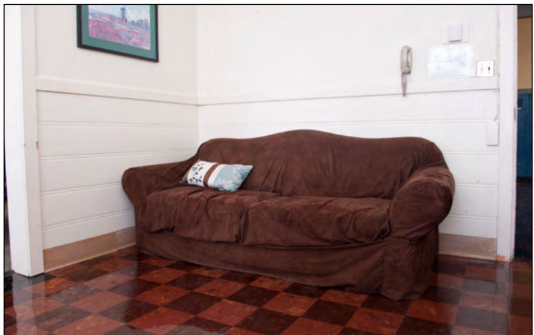
Figure 5. Once inside a school, mice will nest in such mouse-vulnerable areas as a food pantry or stuffed furniture in a staff lounge.