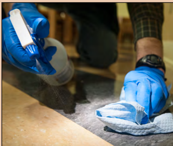
Figure 9. Wear rubber or disposable gloves and use a disinfectant when cleaning up mouse feces.