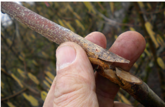
Figure 3. Whip and tongue graft in the field.

The graft most commonly used by hazelnut nurseries is the V-graft, which is done using the Fieldcraft Topgrafter tool (Raggett Industries, Ltd., New Zealand). The Topgrafter is easy to use, especially for bench grafting, and nurseries report success rates in excess of 90%. There is one drawback to this type of graft: If the rootstock and scion are different diameters, extra care must be taken to maintain cambial alignment along one edge while the union is being wrapped because the rootstock and scion are not interlocked and can shift from side to side, losing cambial contact. Some nursery operators staple the graft union together to provide additional support while grafts are being wrapped. Having a rootstock and scion of the same diameter is the best way to ensure proper cambial alignment. A two-bud scion is the standard length, and diameters can range from \frac{3}{16} – \frac{1}{2} inch.