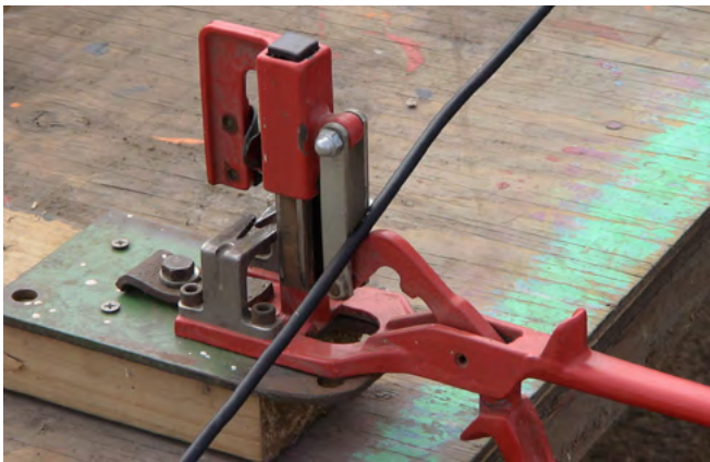
Figure 2. Bench grafting tool.

Grafting done using bare root rootstock is known as bench grafting (Figure 2). Grafting on established trees in the nursery or orchard is called field grafting. Several types of grafts have been used with hazelnuts, including the whip and tongue, cleft, saddle, wedge, and side grafts. The choice of graft depends largely on the grafter's preference. The whip and tongue is the most difficult to master but provides the strongest union before callusing and the most contact area for the scion and rootstock cambiums (Figure 3).