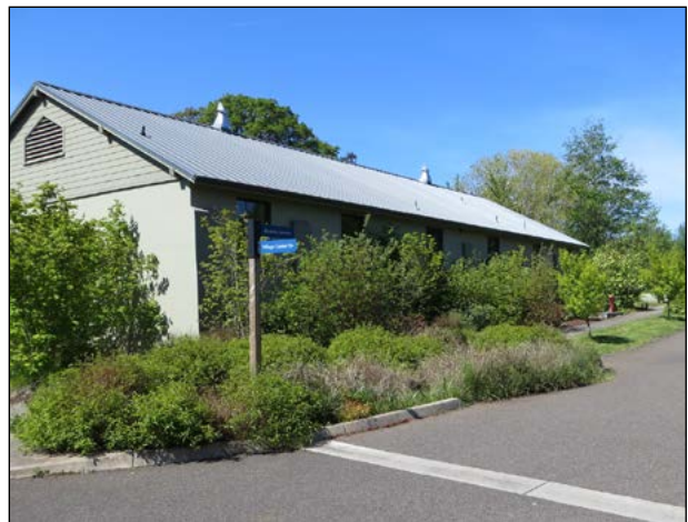
Signe Danler, © Oregon State University

In recent years, “backyard habitats” and wildlife gardens have become popular on a residential scale. This is a fine thing, but can create a patchwork of widely separated oases that are of limited use to wildlife and do little to enhance ecosystem services. It can also be very difficult for individual home or business owners to overcome social pressure to conform to conventional landscape norms.