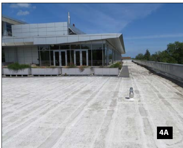
Signe Danler, © Oregon State University

The green building industry now comprises 25 percent of new construction, and a third of nonresidential construction. Ecologically sensitive landscaping is a growing segment of this industry, and studies have shown that capital costs can be reduced by 15 to 80 percent by using green infrastructure in stormwater management, paving, and landscaping.