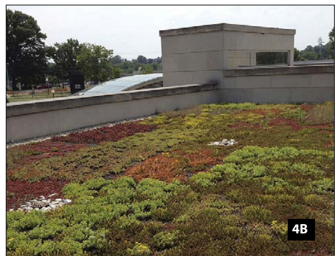
Djembayz, ©CC BY-SA 3.0 license