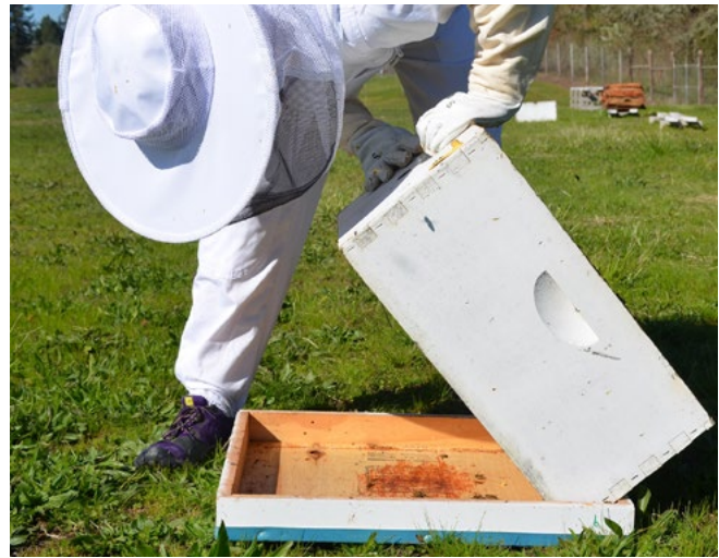
Figure 11. Lifting hive body to inspect beetles that may have moved down onto the outer cover

When a hive is opened for inspection, the beetles quickly flee and hide in hive crevices. The adult