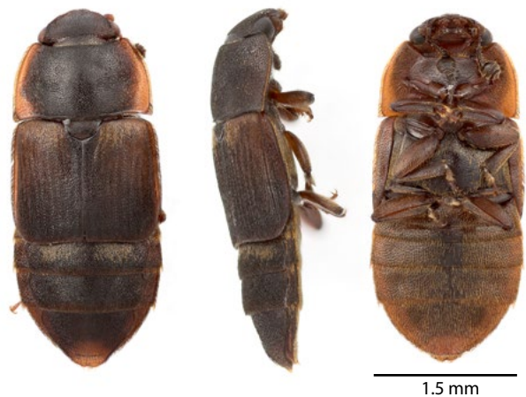
Figure 2. Dorsal, lateral, and ventral view of the sap beetle Brachypeplus basalis (family: Nitidulidae)