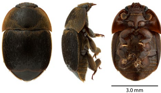
Figure 1. Dorsal, lateral, and ventral view of the small hive beetle.

Rendering: Alan Dennis, Oregon State University