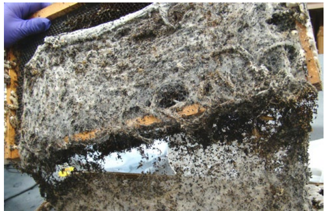
Figure 9. Wax moth larvae damage

In small colonies such as divides or splits, newly hived packages, nucleus hives (nucs), or post-swarm colonies, the SHB population can grow rapidly, beyond the colony's ability to keep it in check. Divides or splits are hives that were established by transferring frames of bees, brood, and food stores from a big or strong parent hive. A nuc or nucleus hive is a small hive consisting of five or six frames. Other factors that appear to exacerbate infestation include too-frequent hive inspections by beekeepers, declines in colony health, and a queen event (loss of queen or supersedure). In colonies having excessive space (multiple empty honey supers) or colonies that have recently swarmed, beetles can lay eggs away from the active bee population and thrive.