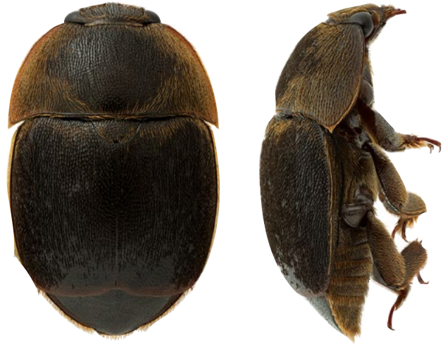
Adult small hive beetle.