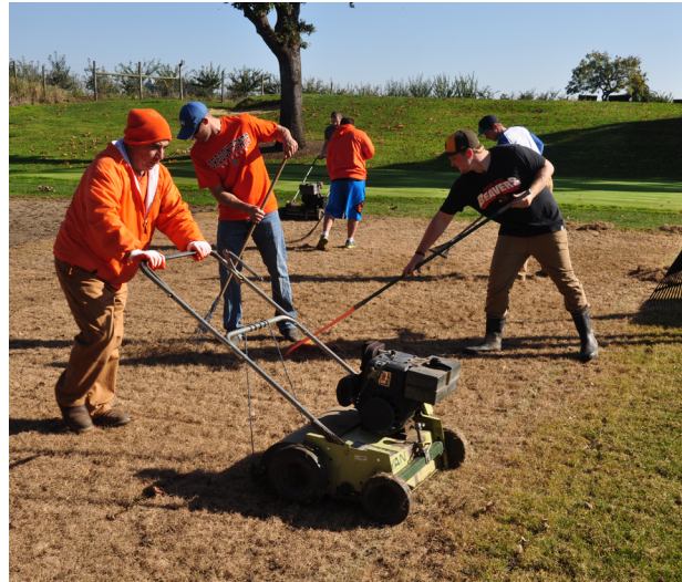
Figure 3. Remove moss using a mechanical dethatcher (foreground) or dethatching rakes or both prior to lawn renovation and interseeding.

Note: Products specifically used to control mosses on roofs and walkways contain copper and zinc, which will injure or kill desirable grasses in lawns. Read the product label carefully; do not use lawn- and structural-moss chemicals interchangeably.