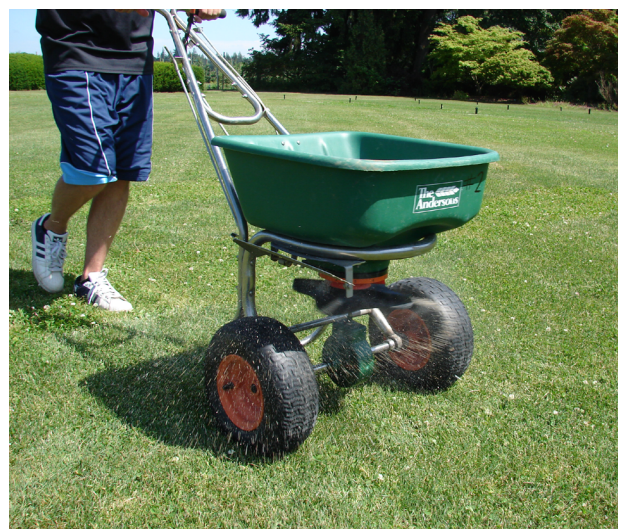
Figure 4. Apply fertilizer to encourage turfgrass growth after mechanical dethatching or pesticide application or both to remove moss.

After removing the moss with a dethacher or herbicides or both, the lawn will have bare areas. To avoid reinvasion by moss and other weeds, it is important to fertilize and interseed the lawn (Figure 4). See "For more information" (page 4) for resources on lawn renovation.