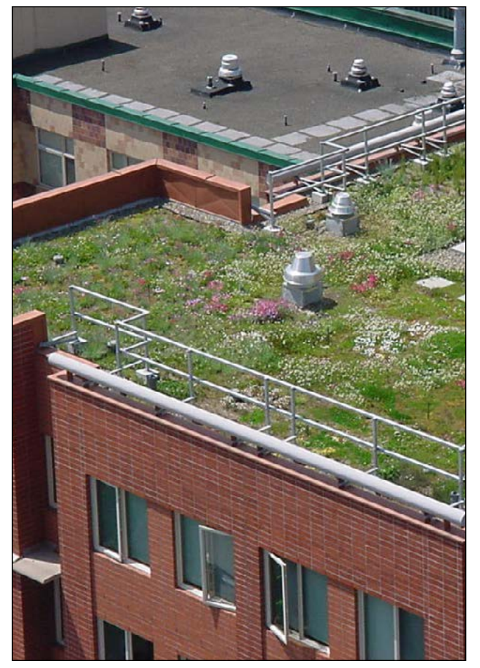
The Hamilton West Apartments ecoroof in Portland, Oregon, is carefully monitored by the City of Portland.

and 10 percent digested fiber (BES 2008a). Suggested water-retention rates are 40 percent by weight or greater. Suggested bulk dry densities are 35-50 pounds per cubic foot (NCDWQ 2007).