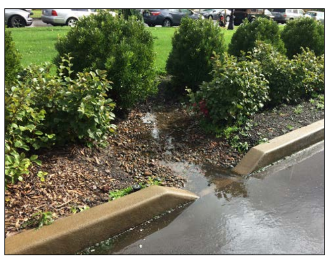
This swale treats water along a road in Corvallis, OR.

Swales should have amended planting soil or amended native soils with infiltration rates that are high enough to pass the design storm through the soil, but not so high that the stormwater does not spend enough time in the soil for treatment (retention time). The ideal infiltration rate is between ½ inch per hour and 12 inches per hour (PSP 2009). The top 18 inches of soil is