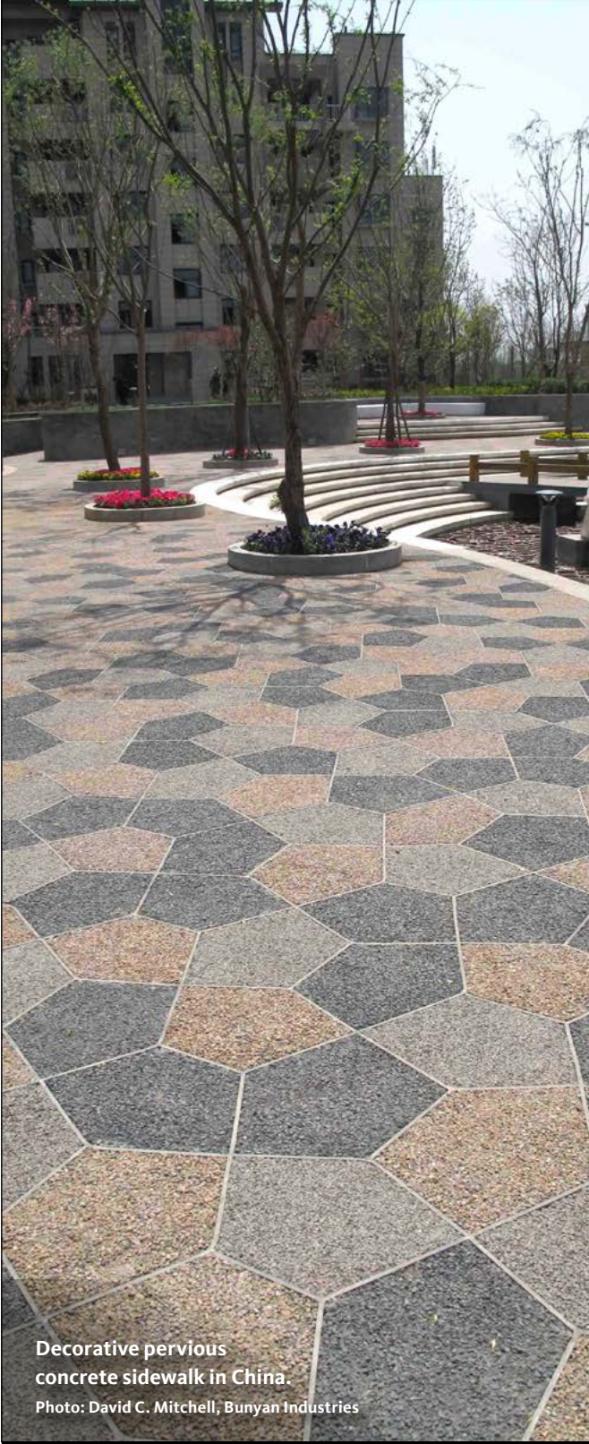
Decorative pervious concrete sidewalk in China.