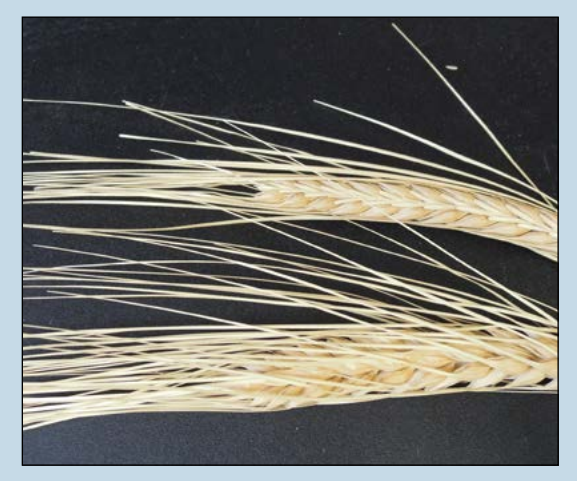
Figure 6. Brewers generally prefer two-row malting barley (top) over six-row (bottom).

Today, large and small brewers alike prefer two-row. Often, the same variety is malted for all-malt (a beer brewed with a 100 percent malted barley as the starch source) and adjunct customers, with lower protein lots going to all-malt brewers.