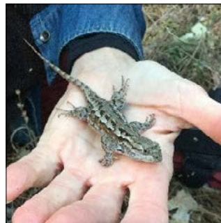
Western fence, or blue-belly, lizard found in a coniferous forest near Applegate, Oregon.

The American marten, or pine marten, is found in Oregon’s high forests.