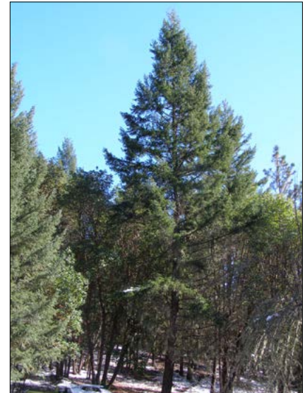
Indicators of tree health issues include dead and dying branches, left, or tree crowns that show sparse or off-color foliage, center. Compare the tree at left to the tree at right. Tree in right photo has healthy crown.