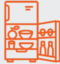
Graphic: Shakeel Ch., The Noun Project

LAST: Use your fresh garden produce and nonperishable foods and staples.