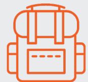
Graphic: Made By Made, The Noun Project

Pack lightweight foods and medications for three days. Carry 1 to 3 quarts of water. You should be able to find additional water that you can make safe. See Survival Basics: Water , https://catalog.extension.oregonstate.edu/em9285 , and Cascadia Action Steps: It's Time to Get Ready , https://catalog.extension.oregonstate.edu/em9284 , for more tips.