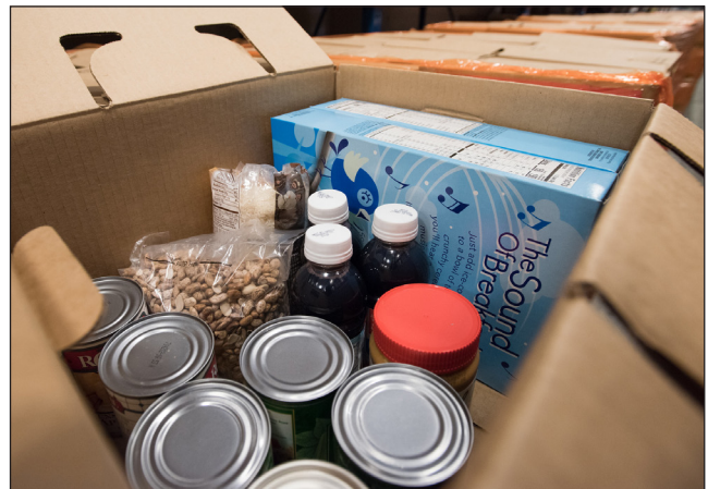
Stock up on foods that don't require refrigeration.

After the Cascadia earthquake, you will need a