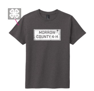
Morrow County 4-H Apparel Available now through May 16th! https://morrowcounty4h.itemo rder.com/shop/sale/