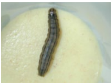
True Armyworm larva