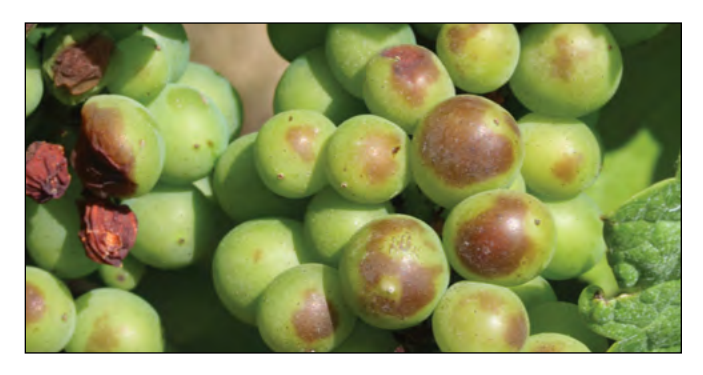
Figure 2. Late season leaf removal can cause berries to burn from overexposure. Berries may form dark areas on the skin or become shriveled and dark.

Cluster zone leaf removal is typically conducted in and around the cluster zone to allow varying levels of sunlight exposure and air flow. This practice can be conducted from early to midseason. Avoid beginning your leaf removal practices late in the season as it can result in sunor heat-burned fruit (Figure 2). It is important to expose clusters earlier in berry development when the berry is producing photo-protective flavonoid