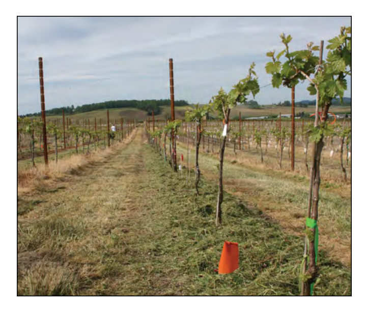
Figure 6. A legume-cereal grain cover crop mix was grown and used as a vine-row mulch to enhance soil moisture, increase nutrient availability, and increase growth of young vines.

nutrient availability to the vines and to manage weeds (Figure 6). Alternating permanent grass cover and tillage in alleys can be practiced to allow some level of competition but also to conserve soil moisture, thereby better managing vigor in moderately vigorous sites (Figure 7). Research conducted in the Willamette Valley shows that