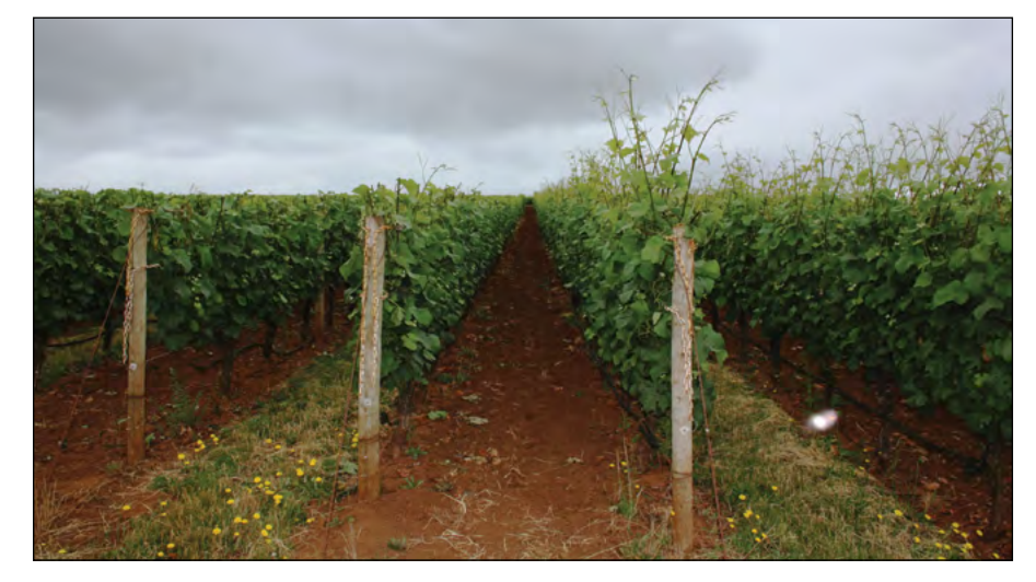
Figure 4. Hedged rows (left) have the correct canopy height-to-rowwidth ratio to reduce canopy and fruit zone shading while unhedged rows (right) have excessive growth beyond the trellis.

Hedging is a common practice for VSP-trained vines in Oregon. The goal is to remove excess primary and lateral shoot growth from the top and sides of the canopy (Figure 4). This is needed to prevent shading and entanglement of shoots between vine rows and to allow worker and tractor traffic through the vineyard. Hedging is