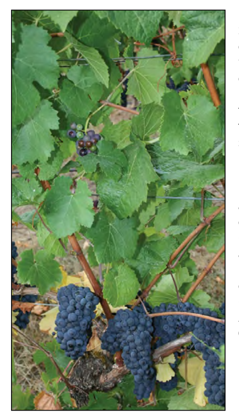
Figure 5: Secondary clusters or "second crop" can form from lateral shoots that emerge from primary shoots. The primary crop is shown (near harvest) and a secondary crop cluster (in véraison) above the primary clusters of Pinot noir.

Crop thinning level. The amount of crop to remove during thinning depends on the yield potential, vine size, and growing region. Vigorous vines (large vine size) have large canopies and are generally capable of ripening more fruit than small, lower-vigor vines. However, it is generally found that cool climate winegrape regions like the Willamette Valley require more leaf area to fully ripen fruit compared to warmer climates that have more light intensity and heat units. Vines