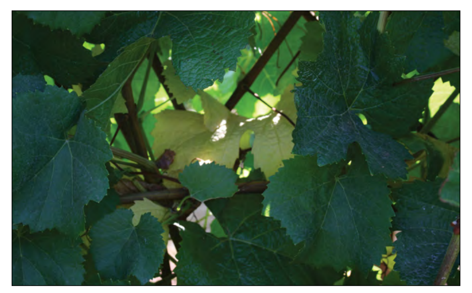
Figure 1. Leaves inside a dense VSP canopy of vigorous vines are often shaded and turn yellow when there is a lack of sunlight. Because these leaves have little function at very low sunlight intensities inside the canopy, they are sacrificed by the vine.

It is important to remember that having too little canopy and overexposed fruit can have negative results on vine health, productivity, and fruit quality. Maintaining a healthy vine size and canopy density should be the goal in vineyard management and is critical to achieve optimum airflow and sunlight exposure.