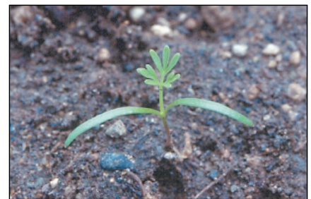
Figure 4.—Wild carrot seedling.