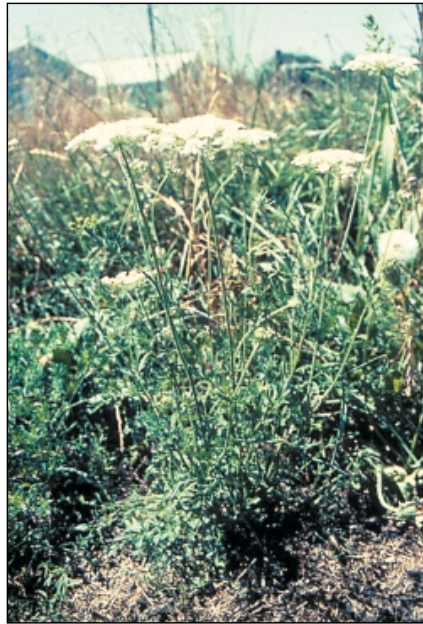
Figure 1.—Mature wild carrot plant.

There is no record of wild carrot toxicity in this country, but there are reports from Europe that wild carrot can be mildly toxic to horses, cattle, and pigs. Animals usually avoid grazing it, but a high concentration of wild carrot in hay is a potential problem because livestock eat hay less selectively than green forage. Ingestion of large quantities can irritate the