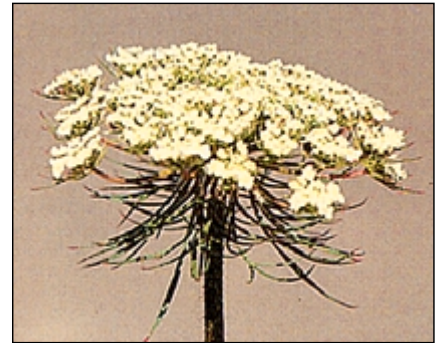
Figure 2.—Note the curved bracts at the base of the flower, which are unique to wild carrot.

Wild carrot forms a deep, whitish taproot that has a distinctive carrot odor. Mature plants reach 2 to 4 feet high and have erect stems and few branches (Figure 1). Stiff hairs