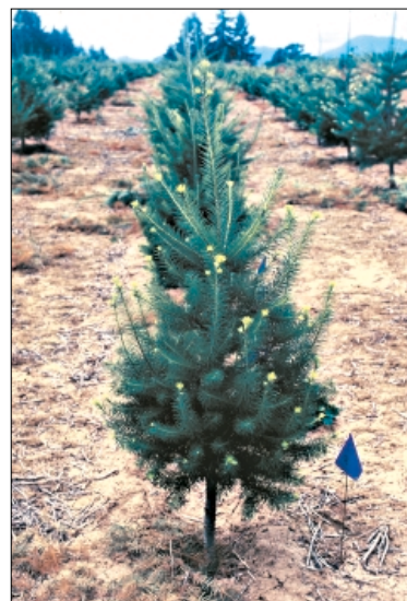
Figure 9b.—Douglas-fir after basal pruning and first shearing.

Leader length control lies at the heart of the art and science of Christmas tree growing. A warning to the beginning grower: it is difficult to rely on general rules because so much