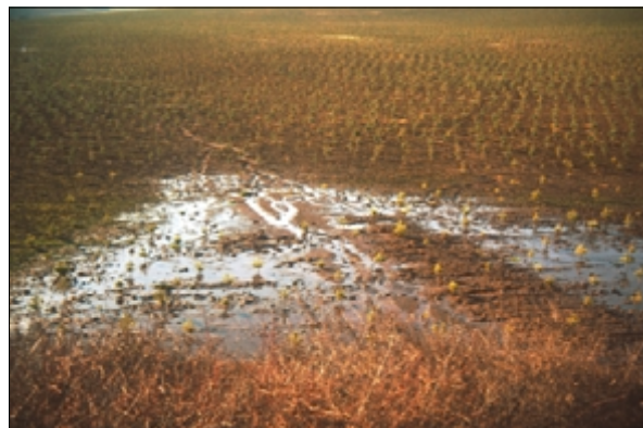
Figure 3.—High winter water tables make part of this site unsuitable for Christmas trees.

The best time to get problem weeds under control is before you plant. Heavy mats of grass and/or woody species such as blackberries can be removed more easily before trees are in the ground. A good plan is to clean up the site in spring and summer, prepare the soil in the late summer, and plant the following winter.