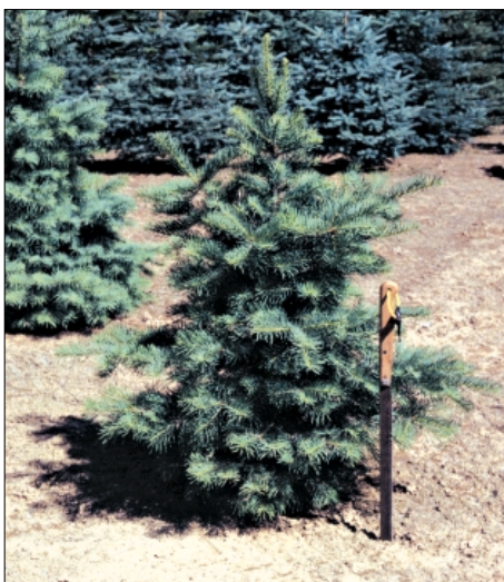
Figure 10a.—Before basal pruning.