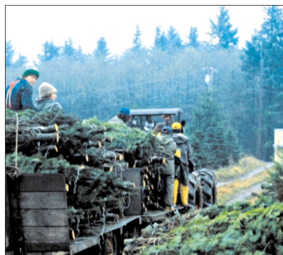
Figure 17.—Yarding noble fir during harvest.

When a truck arrives, you need enough help (about four people plus a tally person) to load it promptly and to make sure that the correct quantities and sizes of trees are on board. Trees for local or regional markets can be covered with tarps and shipped in open trucks. For greater distances, trees generally are shipped in refrigerated vans. Make sure to keep good records about the entire loading operation. It