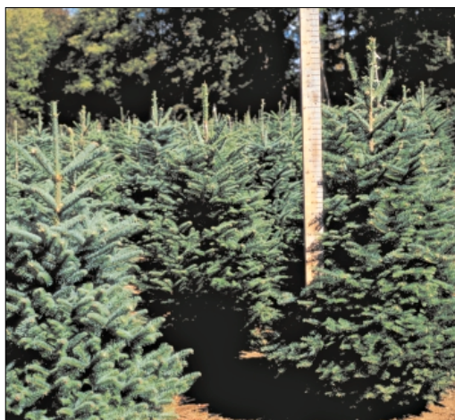
Figure 16.—Measuring harvest trees.

and when and how the various tasks will be performed.