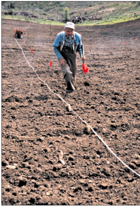
Figure 6.—Field layout using flags and tape measure.

On the other hand, keeping some vegetation can provide a number of benefits, including reduced soil erosion and a less muddy surface during harvest. It is possible to control competition and get the benefits of partial vegetative cover by controlling only the weeds within the tree row or around each tree. Some growers plant less competitive, more desirable ground vegetation between tree rows. The dripline of the tree crown is a good