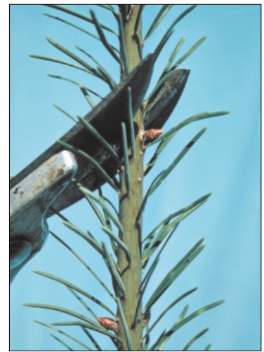
Figure 11.—Leader cutting to selected bud on Douglas-fir.

Timing can be very important. Pines need to be shaped when new needles are about half as long as the previous year's needles. True firs generally are sheared in summer. Hand-picking and branch tipping are done during the early succulent stage of growth.