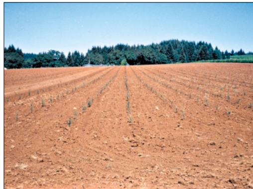
Figure 9a.—Newly planted field.

Basal pruning is commonly done when tree leader length reaches approximately 10 to 12 inches. Growers frequently debate the merits of how much and when to basal prune. Some growers basal prune trees in two lifts (stages) in different years. Other growers wait and sell the basal branches as bough material if markets are available. Regardless of method or timing, basal-pruned branches should be cut near the stem, to prevent resprouting and recutting.