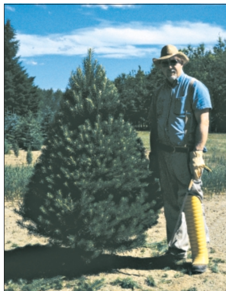
Figure 12b.—After shearing.

University of Idaho studies of grand fir trees in the Inland Empire found little response to additions of nitrogen, phosphorus, potassium, or sulfur other than a small improvement in color from the nitrogen. A similar OSU and WSU study in western Oregon and Washington found nitrogen fertilizers improved color on noble fir and Douglas-fir and slightly improved growth of Douglas-fir on shallow hill soils.