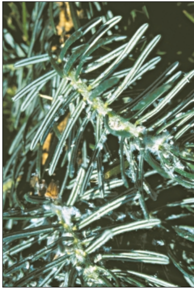
Figure 15.—Aphid feeding on true firs.

Cooley spruce gall adelgid. Another species of adelgid, the balsam wooly adelgid, damages noble and other true firs. Occasionally, these insects can damage a plantation significantly.