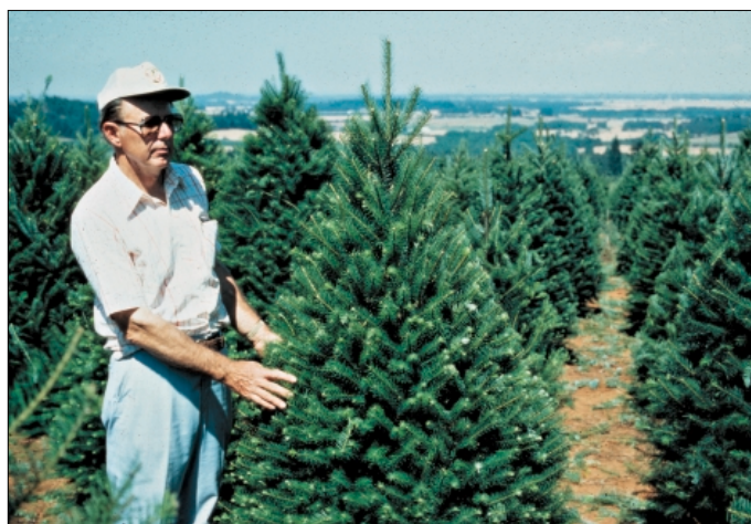
Figure 9c.—Top-quality Douglas-fir after several years of culturing.