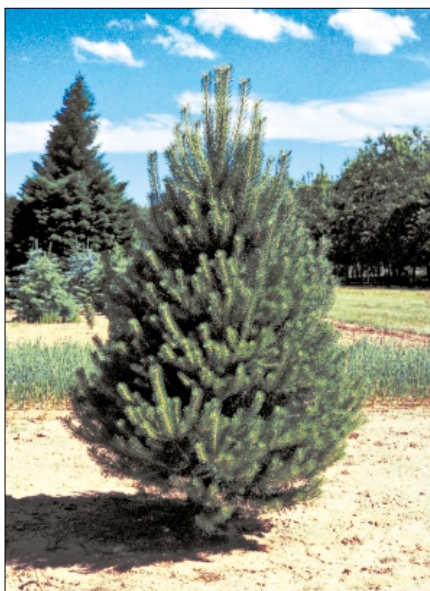
Figure 12a.—Before shearing.

Traditionally, Christmas tree growers add nitrogen fertilizer the last 2 years of the plantation cycle to improve color. Recent research, however, has pointed out that different strategies are important for different species. Likewise, irrigation may change nutrient demand and alter the fertilization regime.