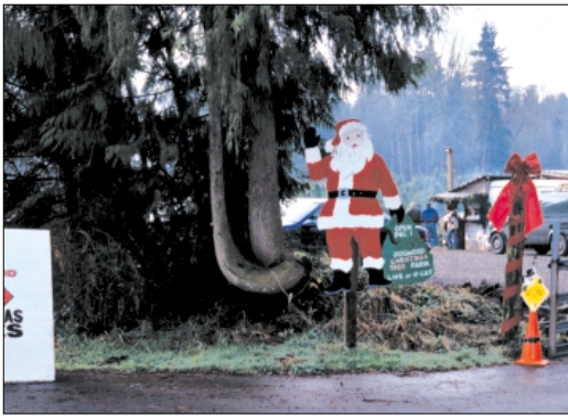
Figure 18.—A U-cut Christmas tree farm.

is not uncommon for questions to arise later about how a particular truck was loaded, the tree tally, or what trees were on the truck.