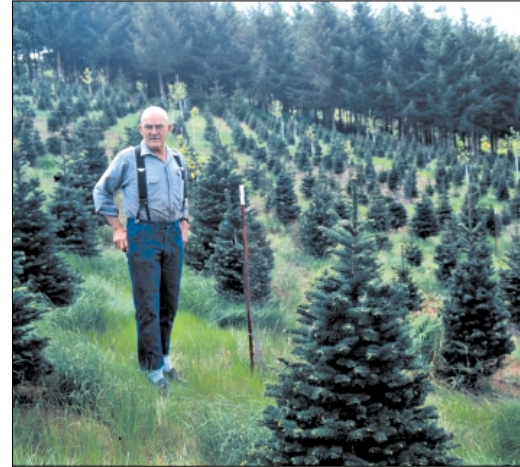
Figure 8.—Some grasses left unsprayed for soil protection.

management. A variety of soil-active and contact herbicides are labeled and approved for use in Christmas trees by the department of agriculture in your state. Before applying herbicides, it's a good idea to discuss your proposed application with a licensed pesticide