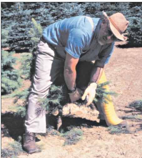
Figure 10b.—After basal pruning.