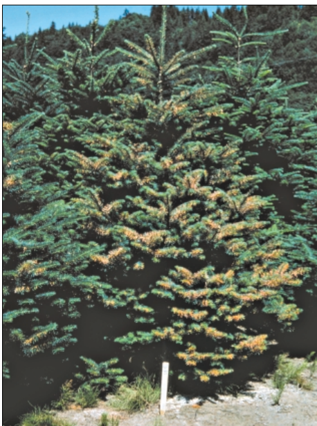
Figure 14.—Current-season needle necrosis on noble fir. (On living trees, the brown color of current-season needles stands in vivid contrast to older needles, which remain green.)

Its signature symptom is loss of interior needles.