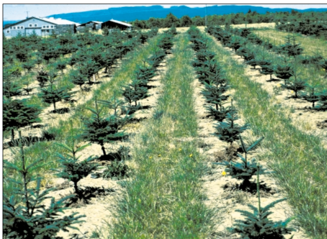
Figure 7.—Weed control along tree rows

Methods to control vegetation include light tillage, mowing, and herbicides. Some growers also are testing landscape fabric and mulches for smaller plantings. Herbicides are, by far, the most common method of weed