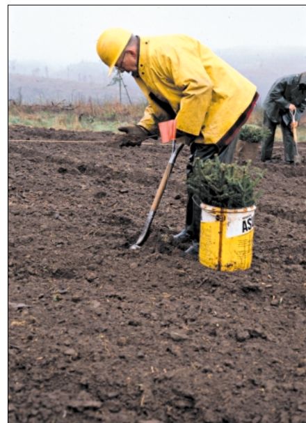
Figure 5a.—Hand planting.

Whatever planting date you choose, also consider tree storage and handling. Many a tree-planting operation has been spoiled because trees were left in the sun or not properly refrigerated while they waited to be planted. Keep trees cool (34° to 37°F) until they are planted. Even at the planting site, do not put bags of trees in direct sun. If trees will be planted within 10 days or so, temporary seedling transplanting (heeling-in) may be