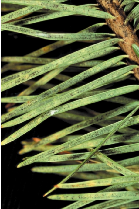
Figure 13.— Swiss needle cast fungus.

Foliage problems Several species of fungi attack Christmas tree needles, causing yellowing and needle loss. Swiss needle cast attacks only Douglas-fir but is a serious problem in western Oregon and Washington (Figure 13).