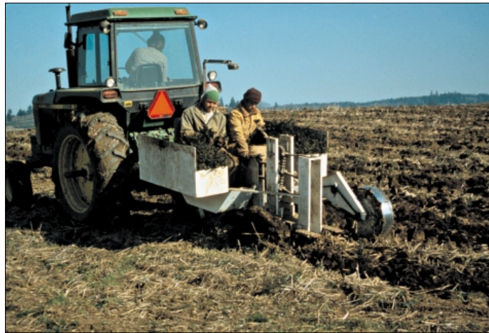
Figure 5b.—Machine planting.

A tree 6 to 7 feet tall needs a minimum field spacing of 5 to 5.5 feet. Tabletop trees (height 2 to 3 feet) can be planted at about 3 x 3-foot spacing if you don’t need tractor access. You might consider leaving more room between rows than within rows (e.g., 6 feet between rows, 5 feet between trees). Planting too closely often lowers profits by increasing pest problems and by making tree management more difficult.