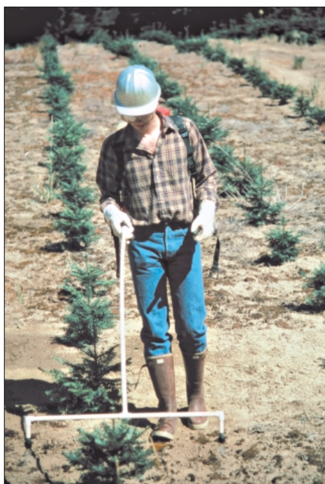
Figure 19.—Pesticide application to prevent grass growth.

A series of Federal Worker Protection Standards govern farm employees' re-entry into property treated with pesticides. Employers also might be required to give employee training, post re-entry warning notices, and provide access to medical care for employees.