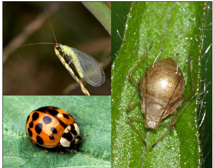
Figure 4. Some natural enemies of large raspberry aphid. Clockwise, from top left: green lacewing; aphid mummy, parasitized by Aphidius; Asian lady beetle.

Regardless of the cultivar you choose to plant, it is important to select certified planting stock that you can expect to be free of known viruses. Virus-infected stock has lower vigor compared to healthy plants, especially in the first 1 to 3 years after planting. Infected plants also provide an inoculum source that may lead to greater virus spread throughout the planting.