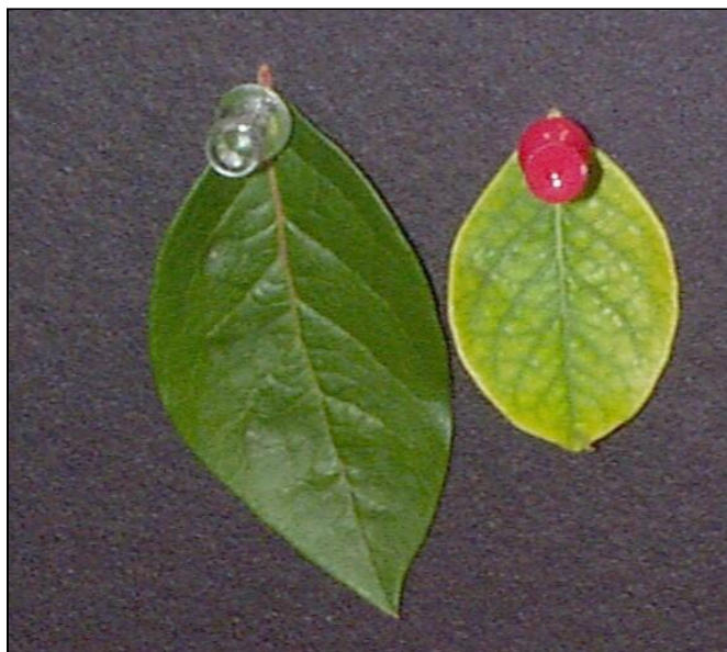
Figure 1. Normal blueberry leaf (left) and iron-deficient leaf (right). Note the pale green leaf area and contrasting green veins on the iron deficient leaf.

Nitrogen and sulfur deficiencies also cause leaves to turn yellow. However, leaves affected by these deficiencies do not have contrasting green veins. Deficiencies of nitrogen and sulfur are uncommon in ornamental plants. As with iron deficiency, the new growth of sulfur-deficient plants is affected first. Nitrogen deficiency is seen first in older leaves. If an application of nitrogen or sulfur does not affect plant color, consider iron deficiency, and hence high soil pH, as a possible cause of yellow leaves.