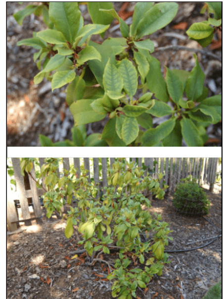
Figure 2. Yellowed leaves do not always indicate that the soil pH is too high. This rhododendron is growing in soil with a pH of 5.4. Always check the soil pH before deciding to acidify your soil.

The most rapid reduction in soil pH is achieved by using elemental sulfur. When elemental sulfur (S) is mixed with the soil, naturally occurring bacteria, thiobacillus, oxidize it. The oxidation creates sulfuric acid in the soil solution, thus reducing soil pH. For the process to work properly, you must mix the elemental sulfur with the soil. If your soil pH is below 6.5, further acidification can be accomplished fairly easily with elemental S. For example, in research conducted near Wilsonville, Oregon, a single application of 45 pounds of S per 1,000 square feet was made to a loam soil with a pH of 5.7 and 3.5% organic matter. After two years, the soil pH was reduced to and stabilized at pH 5.1.