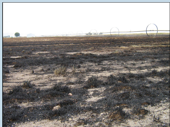
Figure 3. Burning increases soil pH at the surface, thus increasing the likelihood of N volatilization from fertilizer on the soil surface.

For more information, see Montana State University Extension publication EB 173, Management of urea fertilizer to minimize volatilization ( https://www.researchgate.net/publication/237772283_Management_of_Urea_Fertilizer_to_Minimize_Volatilization ).