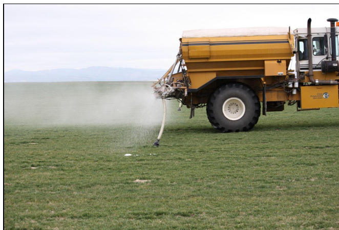
Figure 2. Apply half of the total seasonal N during October or November.

Seed yield reductions can occur if all required N is applied in the spring, so we recommend splitting N applications between fall/spring. Apply one-half or more of the total N for the season during October or November (Figure 2).