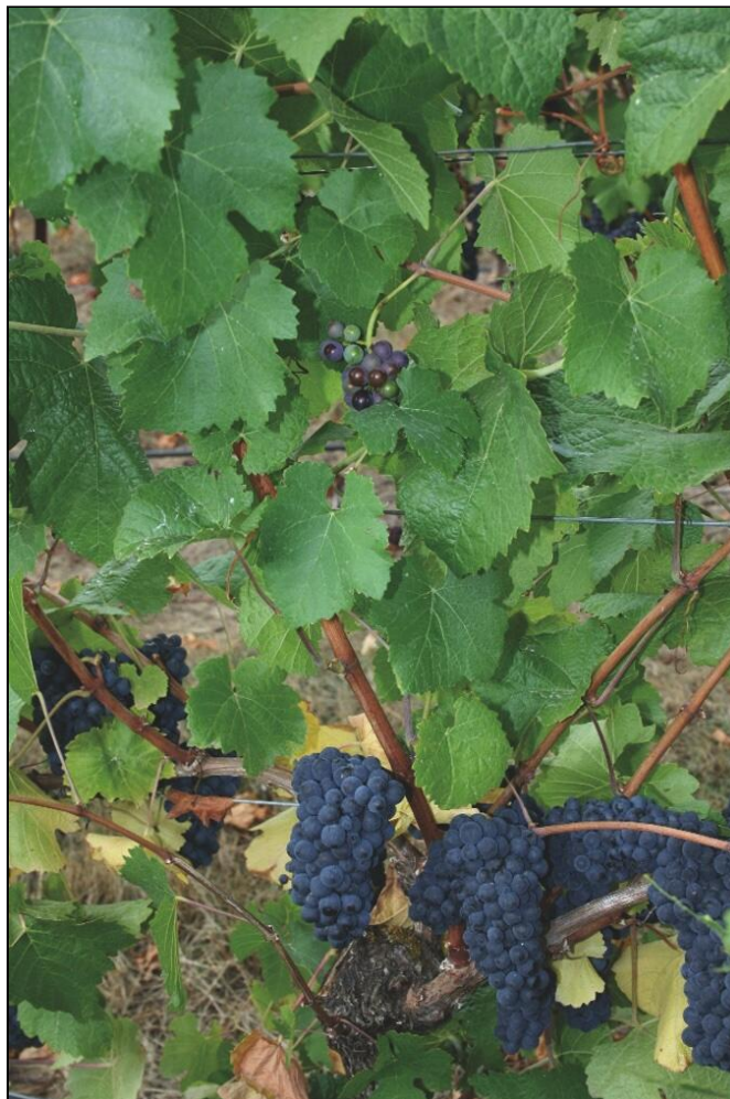
Figure 5: Secondary clusters or “second crop” can form from lateral shoots that emerge from primary shoots. The primary crop is shown (near harvest) and a secondary crop cluster (in véraison) above the primary clusters of Pinot noir.

The amount of crop to remove during thinning depends on the yield potential, vine size, and growing region. Vigorous vines (large vine size) have large canopies and are generally capable of ripening more fruit than small, lower-vigor vines. However, it is generally found that cool climate winegrape regions like the Willamette Valley require more leaf area to fully ripen fruit compared to warmer climates that have more light intensity and heat units. Vines in cool climate regions are often crop-thinned to a higher degree than warmer regions to be able to increase the canopy size relative to the yields. Different cultivars are grown between warm and cool regions, and this too may influence the crop thinning required. It is important to remember that reducing the crop level too much can lead to increased vegetative growth and canopy density, which negatively impacts fruit quality and vine productivity in the future.