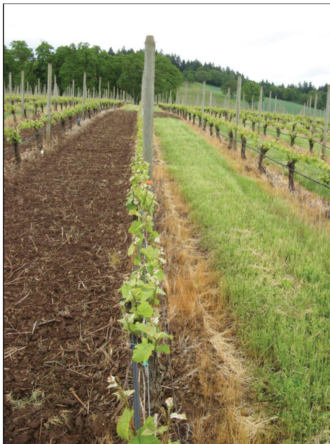
Figure 7. By alternating management of the tractor-rows on either side of the vine row with tillage and a permanent grass cover crop, grape growers in Western Oregon have been able to manage the balance between soil moisture and vine nutrient availability to moderate vine growth.

Managing your canopy with vine balance in mind can help improve both the microclimate of the canopy and the fruit zone and will result in improved fruit composition.