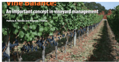
Figure 1. Good canopy management and vineyard design leads to yield that is balanced with an adequate canopy to achieve optimum fruit quality.

V ine balance is a critical concept to understand in viticulture. Vineyard design and management methods used to obtain vine balance help sustain productive yields, achieve desired fruit quality, and preserve overall vine health (Figure 1). The varied climates of wine-producing regions within Oregon present different challenges to managing vine balance; however, the same basic concepts apply across these regions. Vine balance is defined as the state at which vegetative and reproductive growth can be sustained indefinitely while maintaining healthy canopy