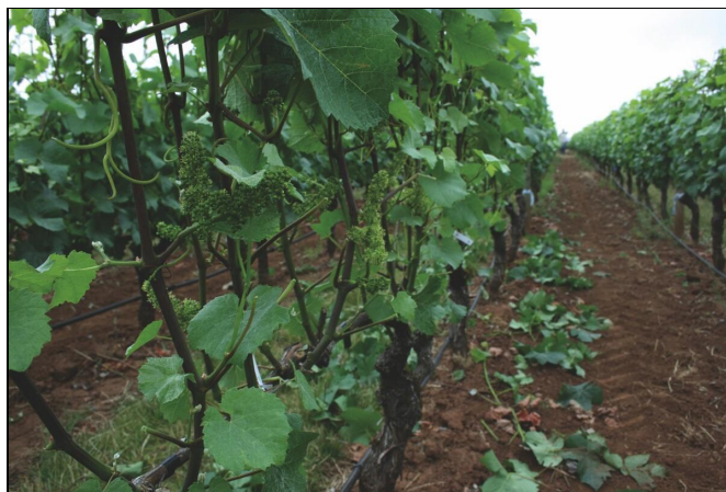
Figure 3C. Leaves were removed by hand on both sides of the canopy.

Removal of leaves in the cluster zone increases sunlight exposure of grape clusters which, when performed early in berry development (at or prior to fruit set), can increase production of secondary metabolites in the berry. As mentioned previously, the berry produces photo-protective flavonoids, many of which also are precursors to