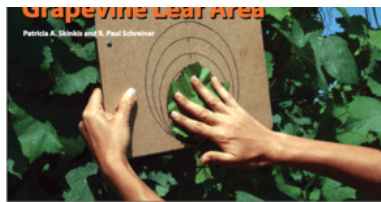
Figure 1. A leaf area template can be easily made using typical office supplies. The template, above, is being used to measure leaf area of Pinot noir vines.

Patricia A. Skinkis | Jan 2023 | OSU EXTENSION CATALOG Peer reviewed (Orange level) ( https://extension.oregonstate.edu/peer-review-guidelines )