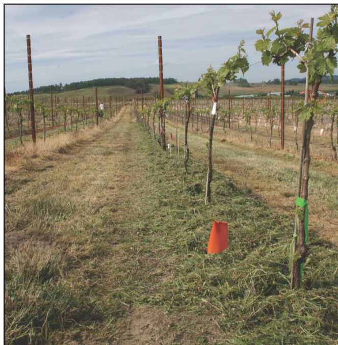
Figure 6. A legume-cereal grain cover crop mix was grown and used as a vine-row mulch to enhance soil moisture, increase nutrient availability and increase growth of young vines.

Research conducted in a high-vigor Pinot noir vineyard in the Willamette Valley has shown that perennial grass cover reduces vine size by competing with the vines for nitrogen. Reduction in vine vigor led to natural yield reduction after five years under these conditions. By reducing vine size in this study, vines were in better balance than in tilled, nongrass-cover treatments, and canopy and fruit exposure increased. In some years, fruit from vines grown with competitive grass cover had higher levels of anthocyanins and better aromatic profiles compared to fruit from vines grown with no competitive cover crops.