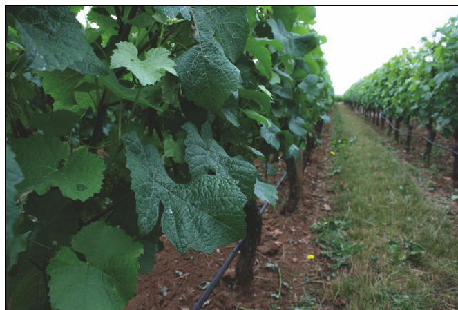
Figure 3A. A bloom-time canopy with no leaf removal.

Leaf removal should be done with caution in the warmer, drier regions of Southern and Eastern Oregon. Vine canopies in these warmer regions are typically smaller and there is less shading of the cluster zone. As a result, there is a greater potential for sunburn of fruit since the temperatures are higher and the relative humidity is lower than in the Willamette Valley. Some leaf removal may be beneficial depending on the vineyard, grape variety, and climate in Southern and Eastern Oregon. If there are heavy disease situations, there may be a benefit of increasing the cluster zone exposure using leaf removal.