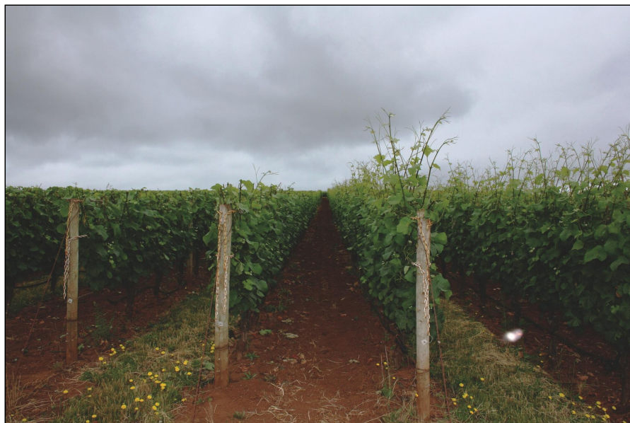
Figure 4. Hedged rows (left) have the correct canopy height-to-row-width ratio to reduce canopy and fruit zone shading while unhedged rows (right) have excessive growth beyond the trellis.

Hedging is a common practice for VSP-trained vines in Oregon. The goal is to remove excess primary and lateral shoot growth from the top and sides of the canopy (Figure 4). This is needed to prevent shading and entanglement of shoots between vine rows and to allow worker and tractor traffic through the vineyard. Hedging is conducted in Oregon from fruit set to véraison and is important to maintain adequate light exposure of leaves, fruit, and developing buds in dense canopies that have excessive vegetative growth. Although hedging decreases canopy by cutting primary and lateral shoots, it does not directly decrease the vine's inherent vigor and can further promote growth by inducing lateral shoot growth in vigorous vines when conducted in early to midsummer.