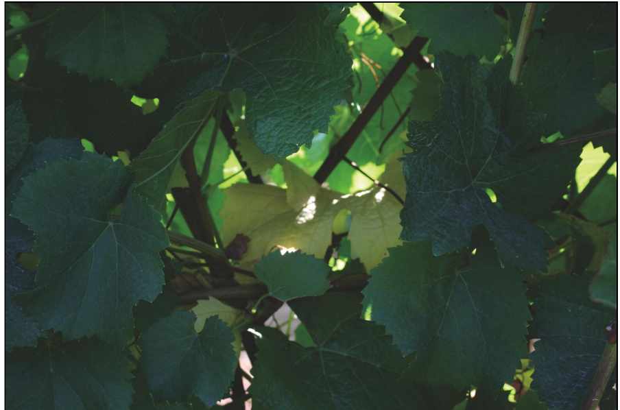
Figure 1. Leaves inside a dense VSP canopy of vigorous vines are often shaded and turn yellow when there is a lack of sunlight. Because these leaves have little function at very low sunlight intensities inside the canopy, they are sacrificed by the vine.