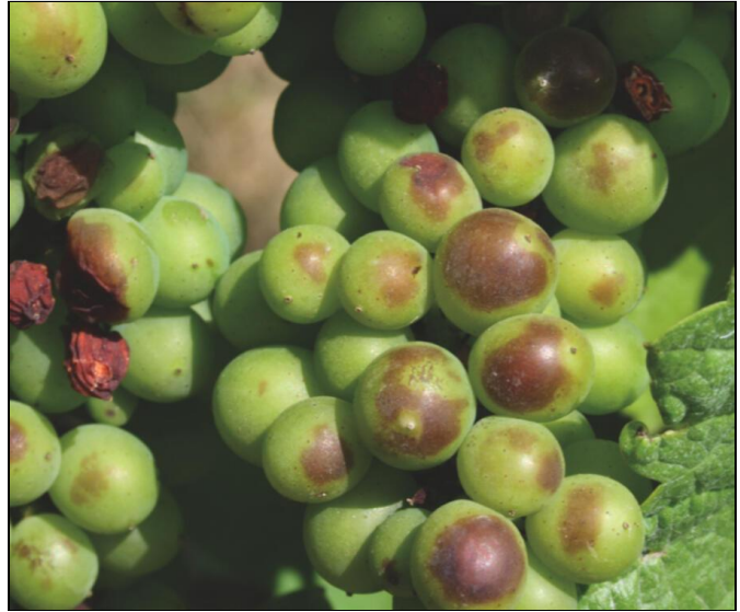
Figure 2. Late season leaf removal can cause berries to burn from overexposure. Berries may form dark areas on the skin or become shriveled and dark.

Conducting the first leaf removal pass through the vineyard at or around véraison (onset of ripening) will expose fruit to increased sunlight and heat load that may result in burn, since the berries have lower levels of these photo-protective compounds and the cells are beginning to soften and become more tender.