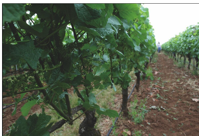
Figure 3B. Mechanical leaf removal is used on both sides of a VSP-trained canopy to reduce leaf cover by approximately 50%.