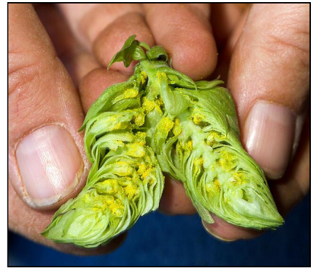
Figure 5. Mature hop cone.

Once the cones are dry, seal them in plastic bags and remove as much air as possible to minimize chemical degradation. Ideally, the cones should be refrigerated or placed in a freezer to further minimize chemical degradation and preserve their brewing value.