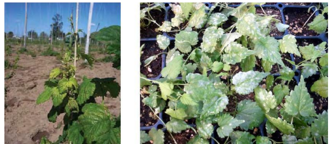
Figure 6. Downy mildew (left) and powdery mildew (right) in hops

In Western Oregon, hop growth can be pruned back to the soil surface during the first two weeks of April. Hop bines that emerge after this pruning event will largely avoid the time period of greatest downy mildew incidence, and fungicide applications may not be necessary. Diseased shoots that emerge later can be removed by hand and discarded as they appear. When downy mildew is a persistent problem, you can help suppress it by removing leaves on the lower 1 to 3 feet of plants after training.