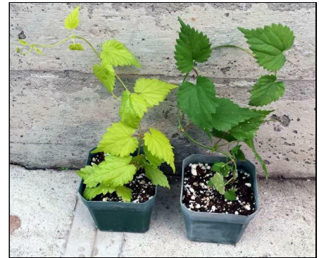
Figure 2. Comet (left) has distinctly yellow foliage.

Ornamental hops usually have a desirable foliage characteristic, such as an unusual color (for example, yellow or purple), but may also produce cones (Figure 2). Thus, the hop cultivar you choose depends on the intended use, which for homeowners is usually for home brewing or ornamental purposes