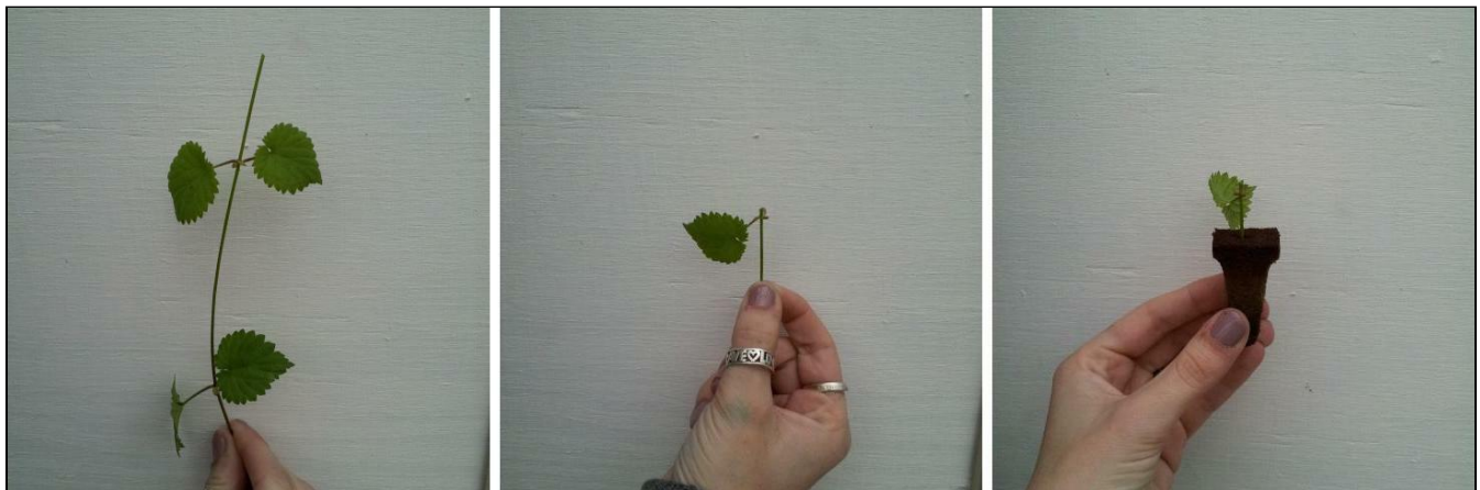
Figure 3. A hop bine (left) may be dissected into several cuttings each with one node and leaf (middle) and planted in florist's foam (right) or sand for rooting.