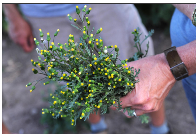
Figure 6. Weeds are a major issue for all sectors of nursery production.