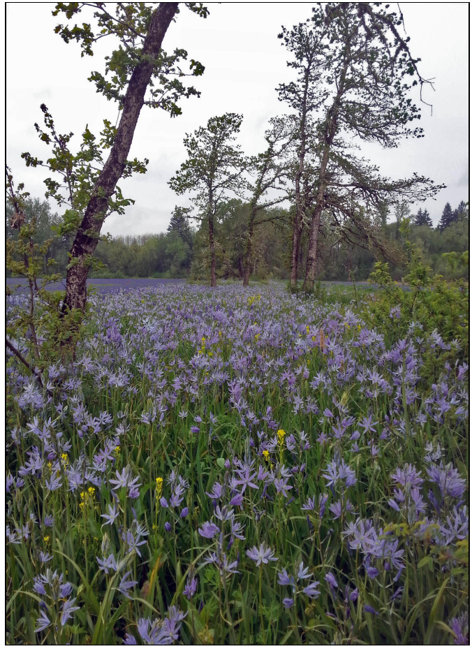
Figure 4: Camas and other wildflowers responded with abundance after ash trees were removed from this site in Washington County, Oregon, to create habitat for oaks. Oaks are a viable option for wet clay soils such as this.

The good news is that oak and ponderosa pine can thrive on at least some of these sites. Prior to European settlement, many modern ash stands were savanna-wet prairie complexes occupied by widely scattered oak and sometimes pine. Ash has invaded these former savanna-wet prairie complexes as a result of the loss of frequent fire. Generally, if you see a stand of ash on heavy clay on a valley floor, you are likely to find occasional oaks mixed in as well, at least on the drier fringes. Sometimes, these oaks are legacy trees older than the invading ash.