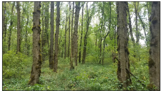
Figure 1. Oregon ash wetland forest. Although this stand floods in winter, it is dry in summer.

This guide will help you choose alternatives to Oregon ash in the variety of habitats it occupies. The information here can also help sustain ash in areas where it might continue to provide essential functions despite the emerald ash borer.