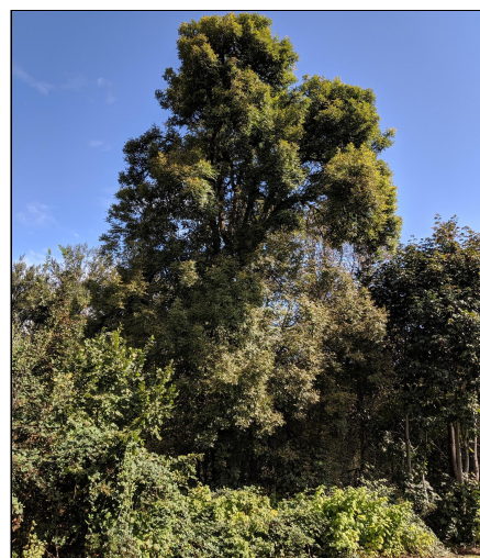
Figure 2. Ash growing with black cottonwood, red alder and bigleaf maple along a stream in the northern Willamette Valley.

https://extension.oregonstate.edu/collection/emerald-ash-borer-resources