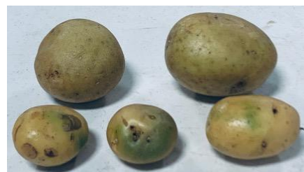
Figure 1. Tuber greening in potato tubers following light exposure.

Glycoalkaloid levels higher than 200 milligrams per kilogram in fresh potatoes are unsafe. The Joint FAO/WHO Expert Committee on Food Additives — an international panel of experts with the Food and Agriculture Organization of the United States (FAO) and the World Health Organization (WHO) — considers a glycoalkaloid level below 100 milligrams per kilogram of fresh potatoes not a concern. Low levels of glycoalkaloids can cause abdominal pain, diarrhea, sweating, bronchospasm, vomiting and other gastrointestinal discomfort. Higher doses of glycoalkaloids lead to acute intoxication. Severe symptoms include neurological disorders, rapid pulse, low blood pressure, coma or death. Glycoalkaloids can remain in the body for more than 24 hours after ingestion.