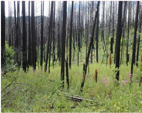
(Cropped from original)