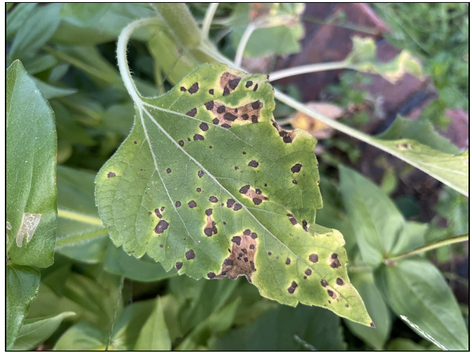
Fungal leaf spots can show up on sunflower leaves but rarely require treatment.