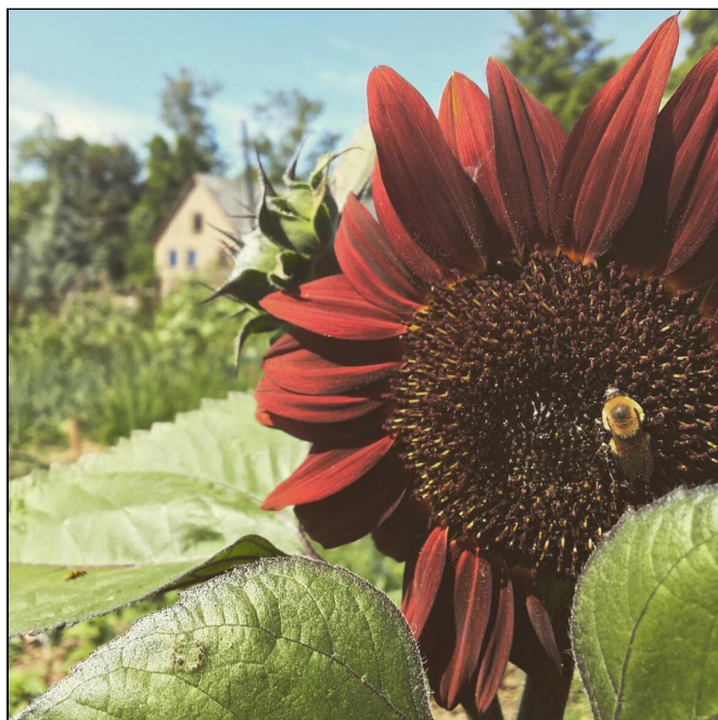
Sunflowers come in a variety of yellow, orange and red tones and attract pollinators like bumblebees.

Sunflowers are considered one of the easiest cut flowers to grow, bringing a pop of color to a mixed bouquet or looking beautiful in a vase on their own. The largest varieties should be avoided for use as cut flowers since their size can make cutting difficult and be impractical in bouquets and normal vases. Pollen-free varieties such as ProCut® and Sunrich™ have been bred to avoid dropping pollen in the house and are preferred for cut flowers because of their long vase life. Sunflowers generally perform best as fresh cut flowers, but certain varieties such as Sunbright are also good for drying.