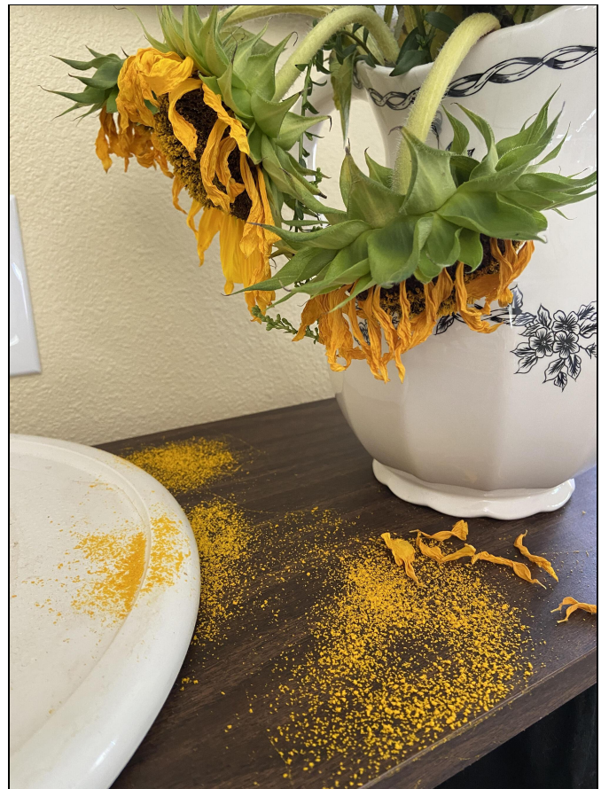
Pollen-producing varieties can shed pollen and stain surfaces if used as cut flowers.