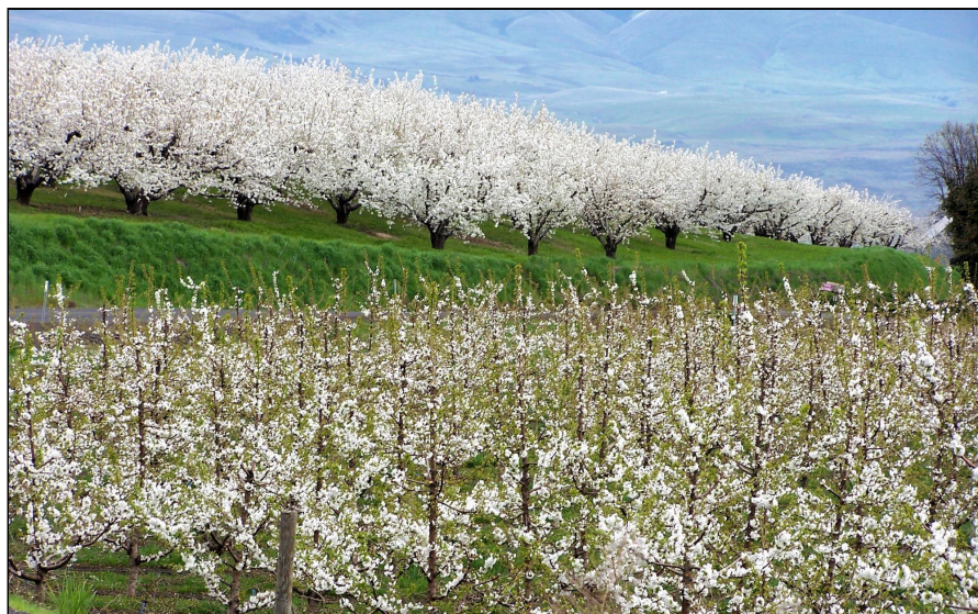
Sweet cherry trees on vigorous and semi-vigorous rootstocks.