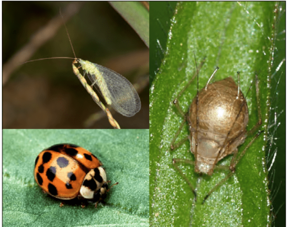
Figure 4. Some natural enemies of large raspberry aphid. Clockwise, from top left: green lacewing, aphid mummy, Asian lady beetle.