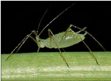
Figure 1. Adult large raspberry aphid, Amphorophora agathonica .

Large raspberry aphid is notable as a vector of viruses in Rubus , including Raspberry leaf mottle virus (RLMV, semi-persistent) and Raspberry latent virus (RpLV, persistent) in red raspberry, and Black raspberry necrosis virus (BRNV, non-persistent) in black raspberry. These viruses are to blame for decreased cane vigor and field decline requiring frequent replanting, as well as crumbling fruit symptoms in red raspberry.