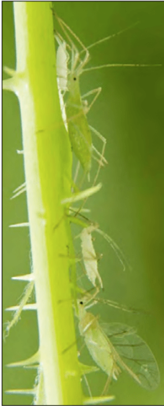
Figure 3. Adult (larger, green; near top) and nymphs (smaller, light green) of the large raspberry aphid.

Photo © Michael Dossett. Used by permission.