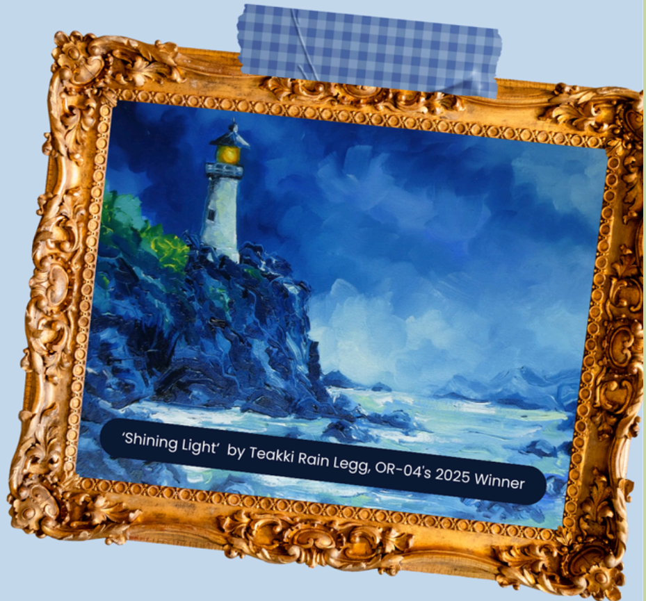
'Shining Light' by Teakki Rain Legg, OR-04's 2025 Winner

Scan the QR code or visit https://beav.es/Ngm to learn more!