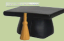
Grad hat stress toy,