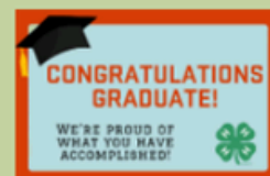
and yard sign