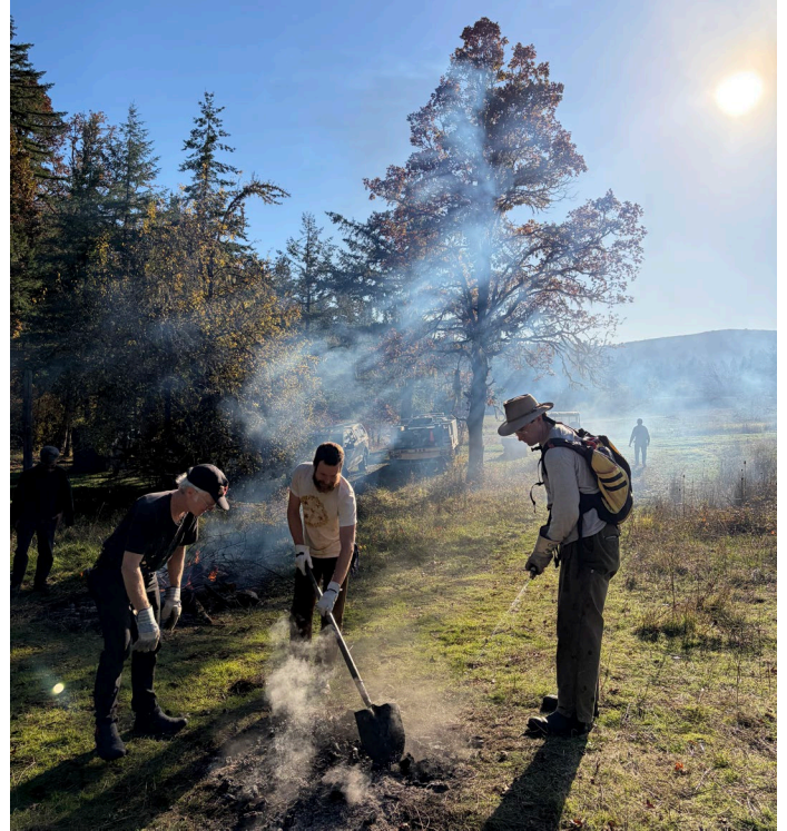
Pile Burning Workshop