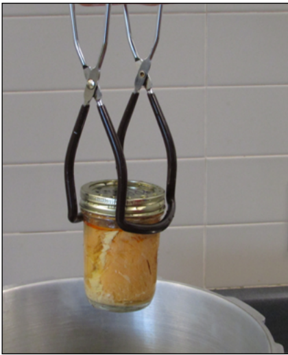
Figure 2. Using a jar lifter, remove jars from the canner without tilting them.