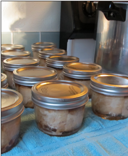
Figure 3. Place the jars on clean towels or a cooling rack, leaving 1 inch of space between each jar.