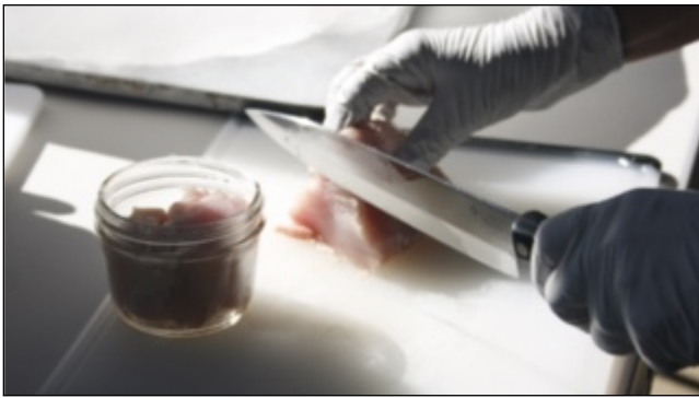
Figure 5. For tuna, cut quarters crosswise with a sharp knife into lengths suitable for jars.