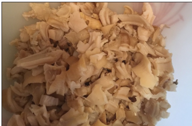
Figure 7. Minced clams ready to be put in jars.