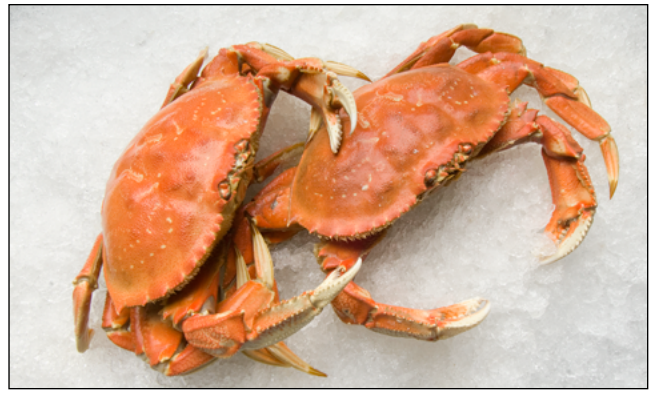
Figure 8. Keep crab alive and on ice until you are ready to can.