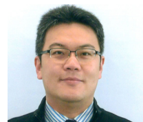
Si Hong Park Oregon-wide Food safety biology